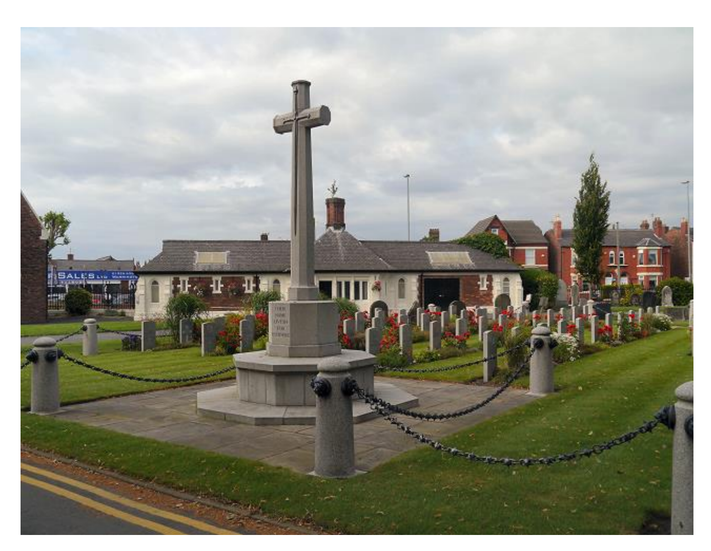
Cross of Sacrifice & War Graves in Warrington Cemetery