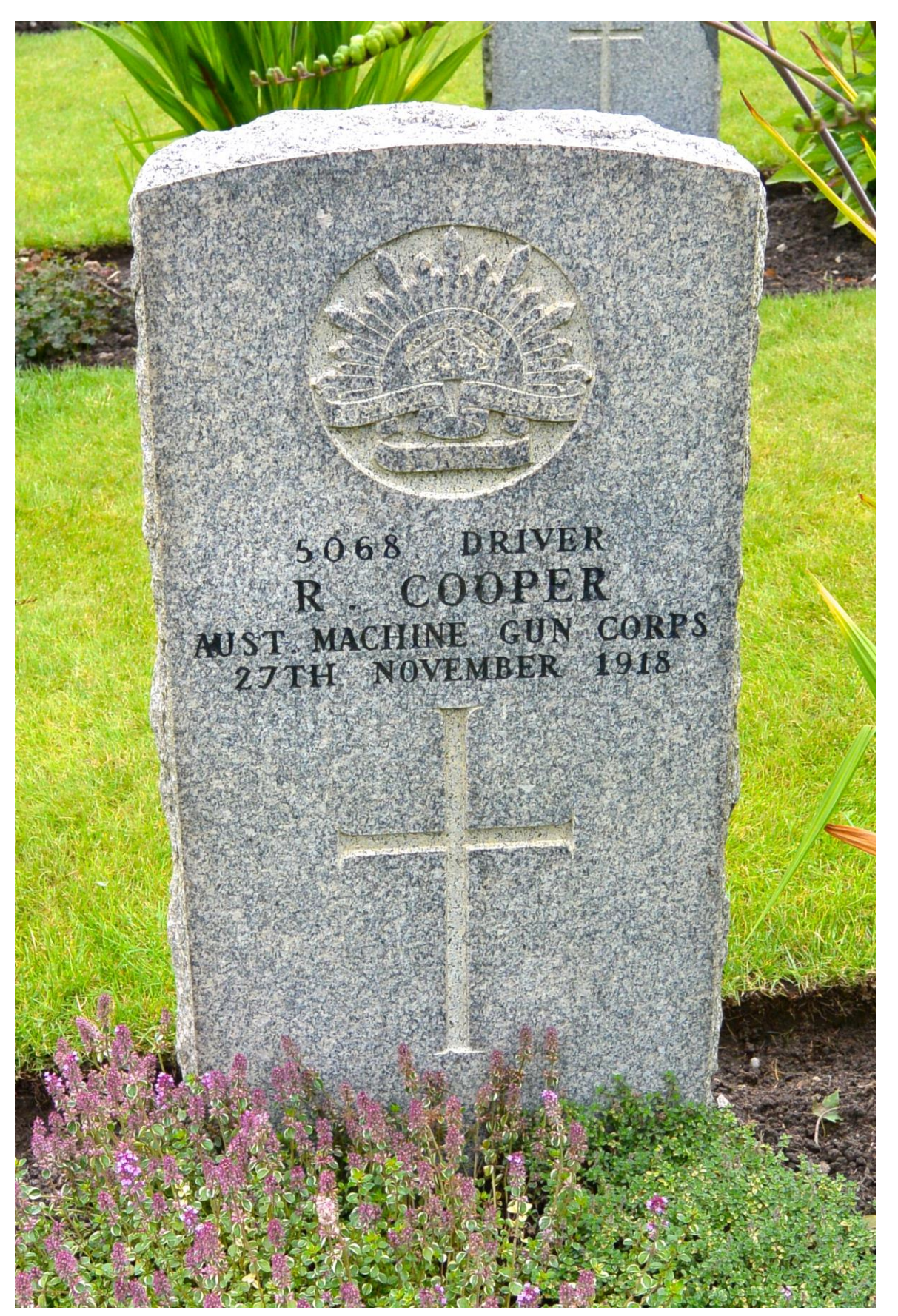
Photo of Driver R. Cooper's Commonwealth War Graves Commission Headstone in Western Necropolis Cemetery, Glasgow, Scotland.