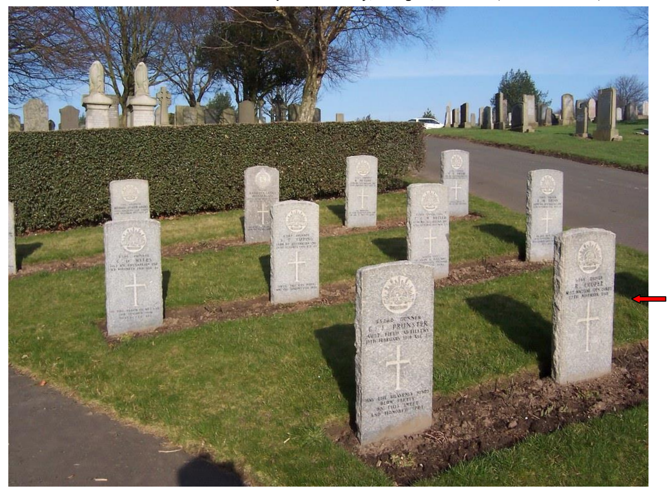
Some of the Australian Headstones in Western Necropolis Cemetery, Glasgow, Scotland Driver R. Cooper's headstone marked by red arrow