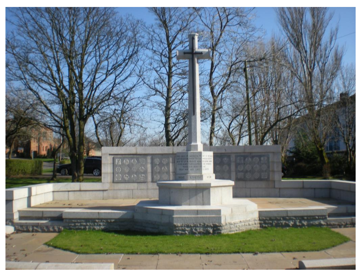
Cross of Sacrifice in Western Necropolis Cemetery, Glasgow, Scotland