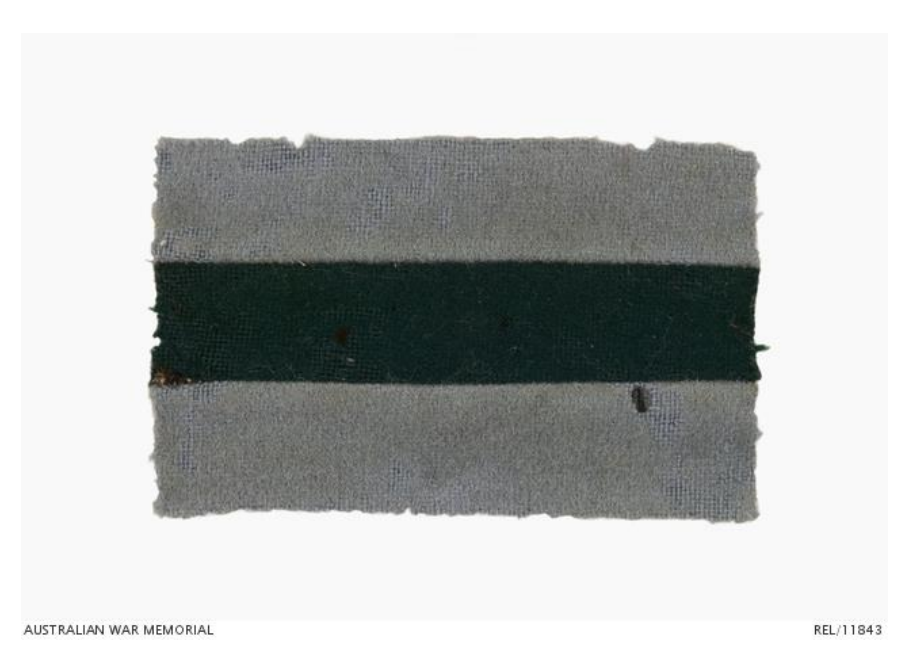
1 (Tropical) Battalion, Australian Naval and Military Expeditionary Force colour patch. The colour patch consists of a grey rectangular base with a horizontally aligned central green strip.