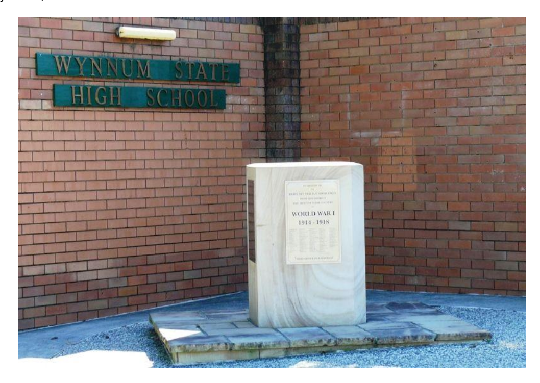
Wynnum High School War Memorial