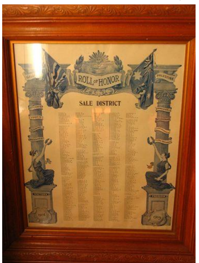
Sale District Roll of Honour