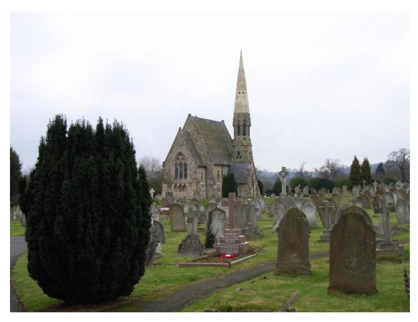
Windsor Cemetery

Windsor Cemetery, Windsor, Berkshire contains 87 Commonwealth War Graves – 53 from World War 1 & 34 from World War 2.