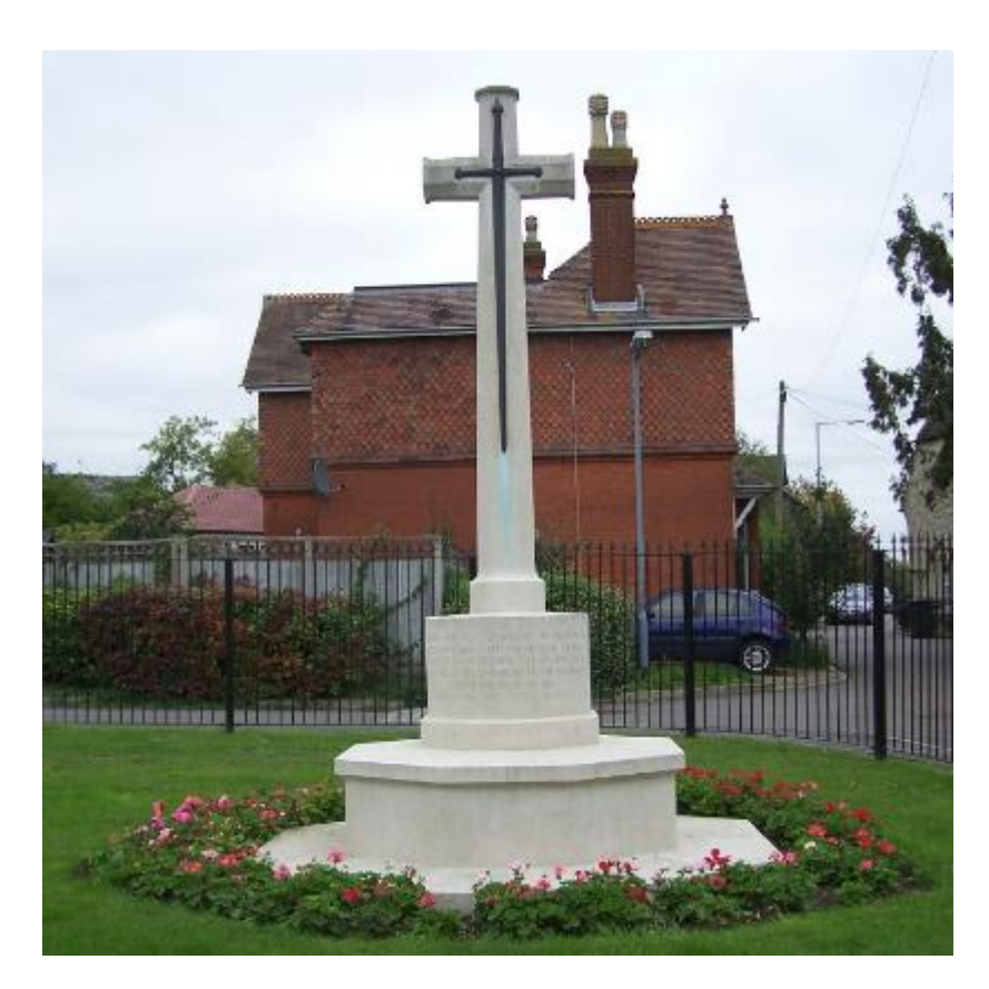
Cross of Sacrifice