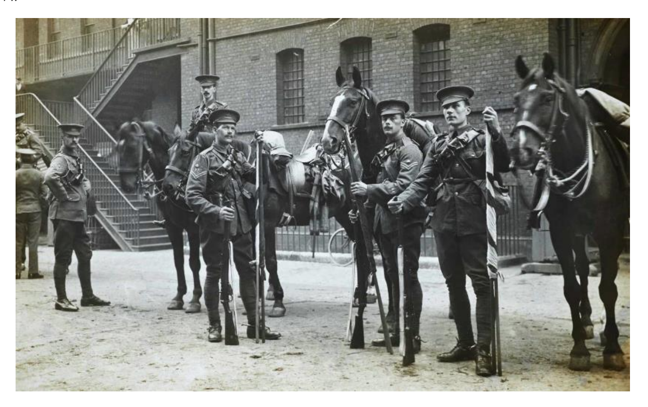
1st Life Guards mobilising at Knightsbridge Barracks to leave for France, August 1914

1914 - The Battle of Mons, The Battle of Le Cateau, The Battle of the Marne, The Battle of the Aisne, The Battles of Ypres 1914.