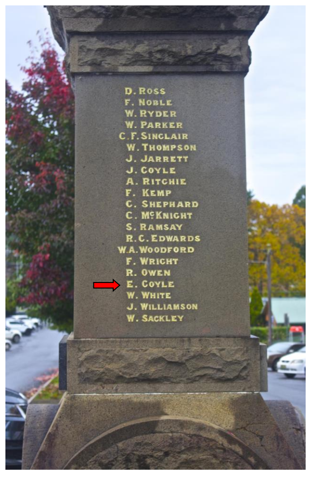
Dorrigo War Memorial