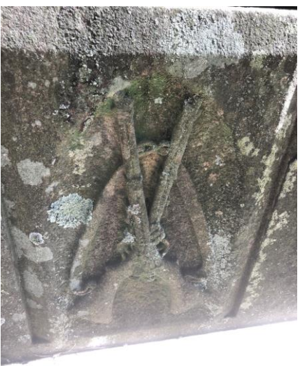
Crossed Rifles