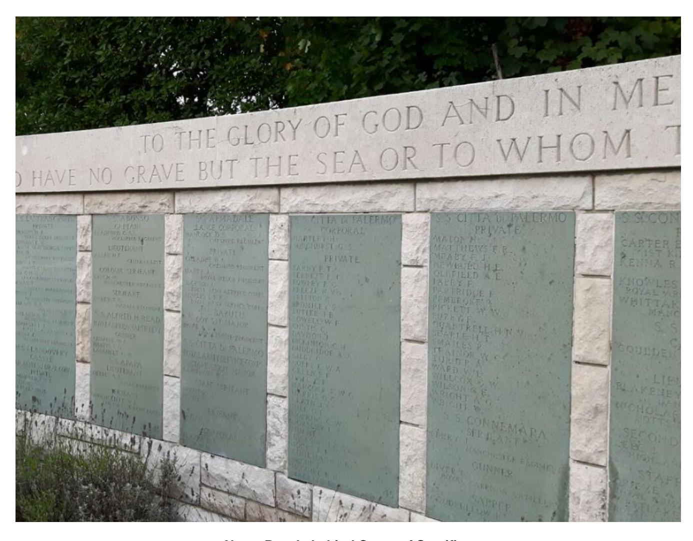
Name Panels behind Cross of Sacrifice