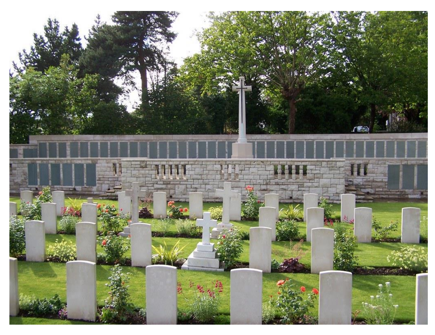
CWGC Graves in Hollybrook Cemetery with Cross of Sacrifice & Hollybrook Memorial