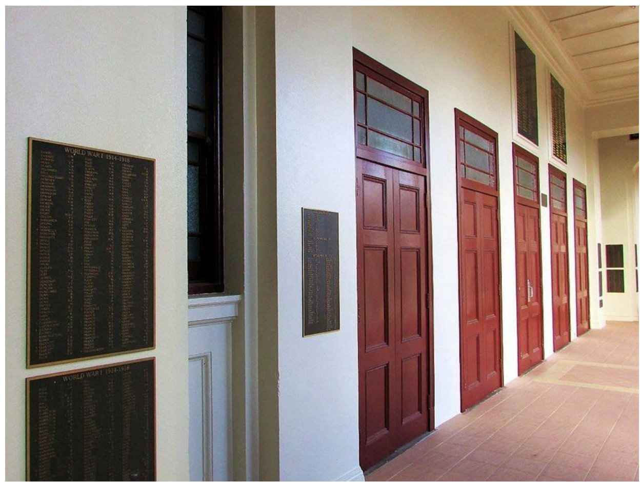
Moree Boer War & World War One Honour Roll