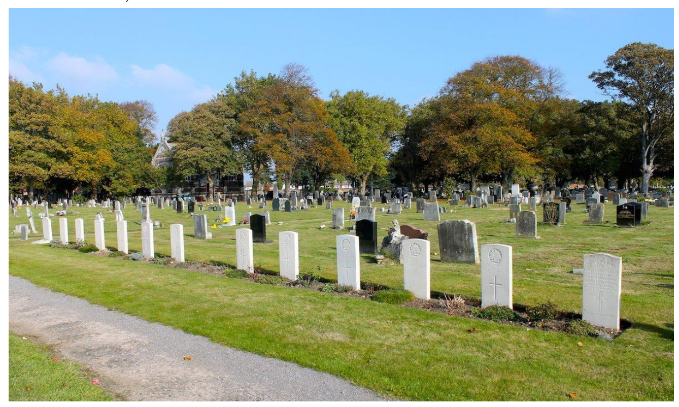
Australian War Graves in Milton Cemetery, Portsmouth