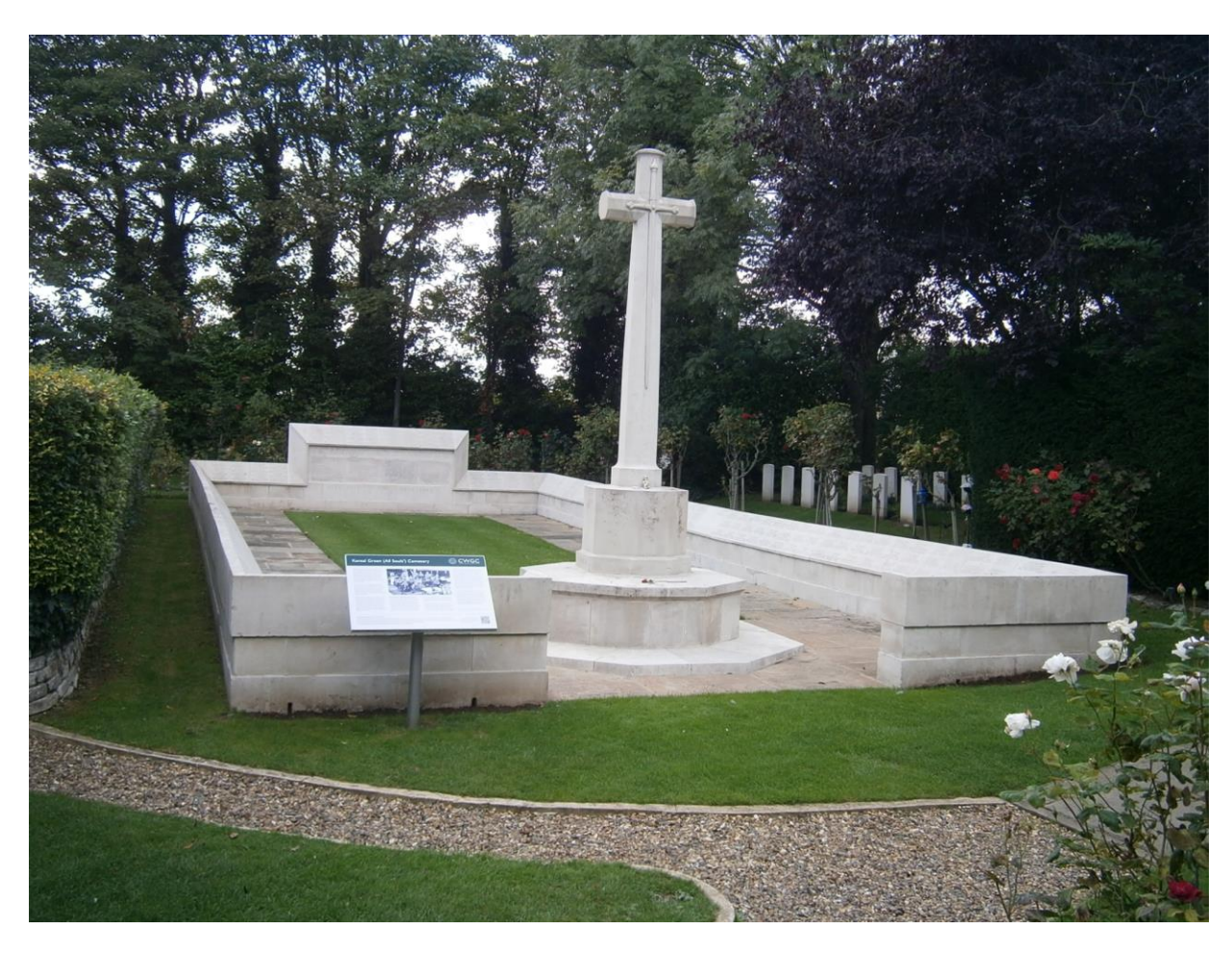
Cross of Sacrifice - All Souls Cemetery, Kensal Green