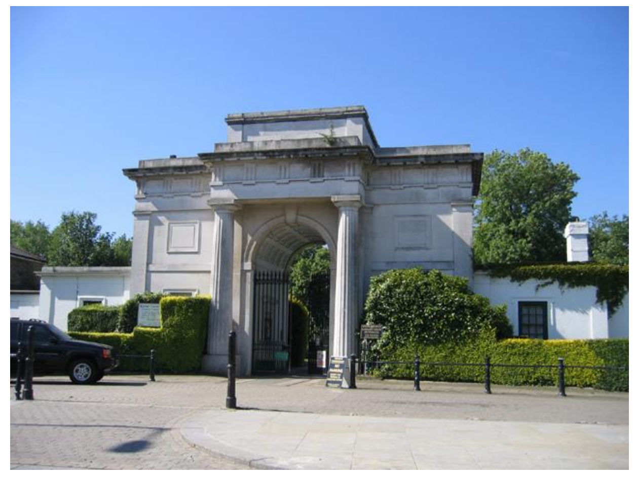
All Souls Cemetery, Kensal Green