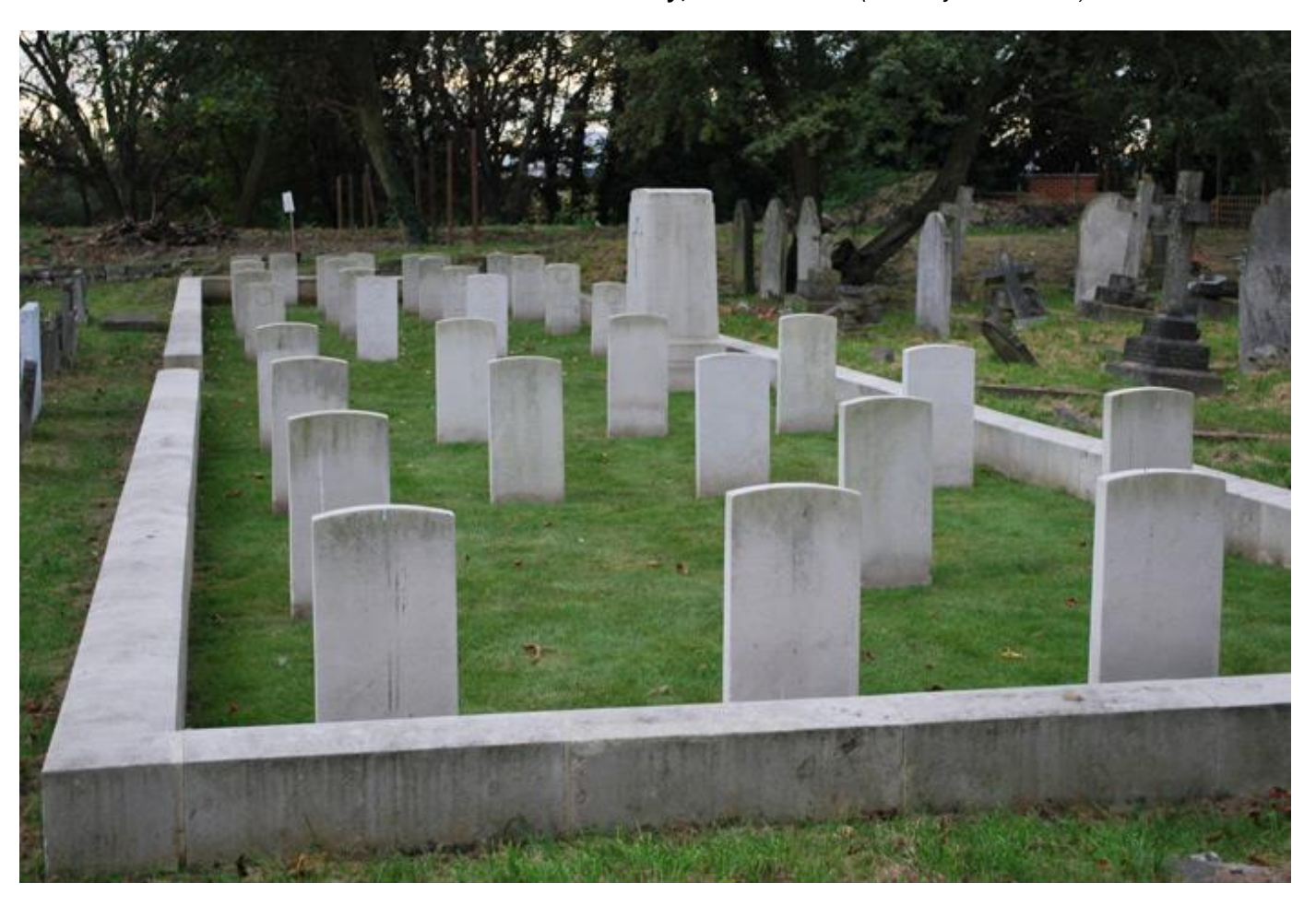
All Souls Cemetery, Kensal Green