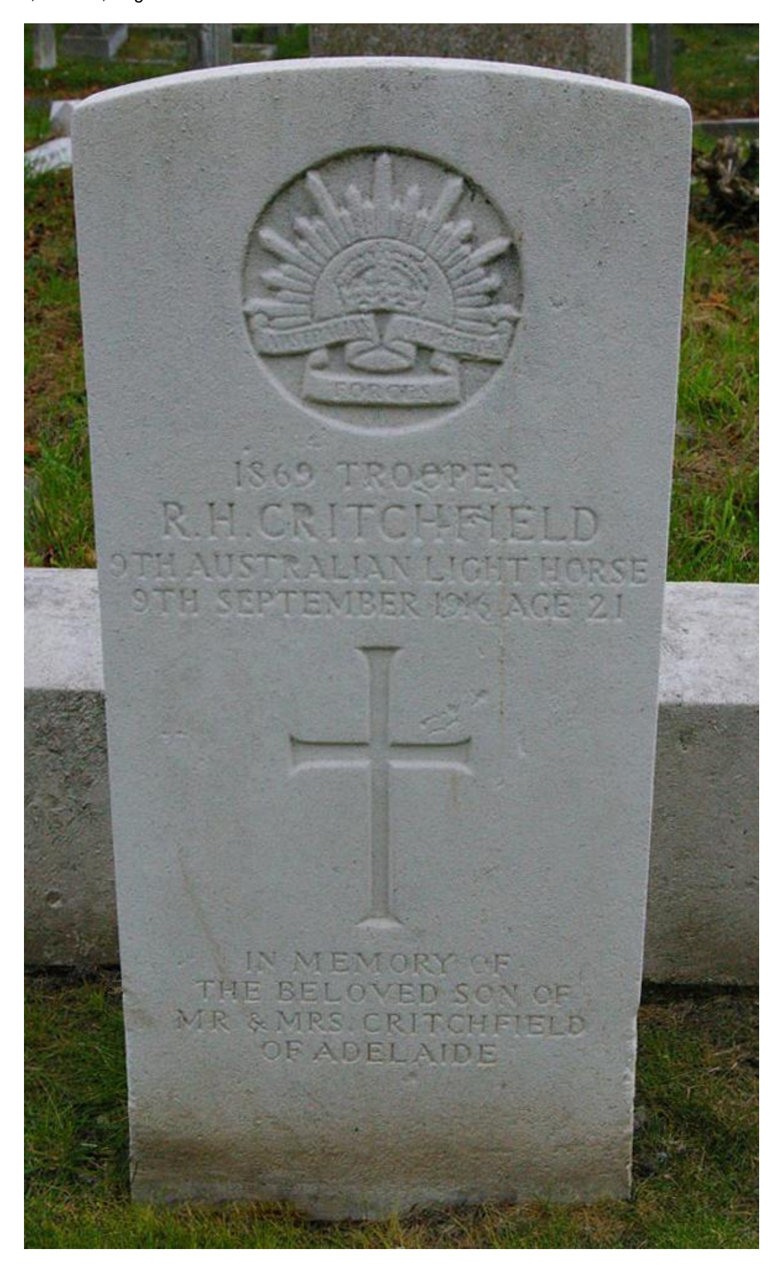
Photo of <u>Trooper</u> R. H. Critchfield's Commonwealth War Graves Commission Headstone in All Souls Cemetery, Kensal Green, London, England.