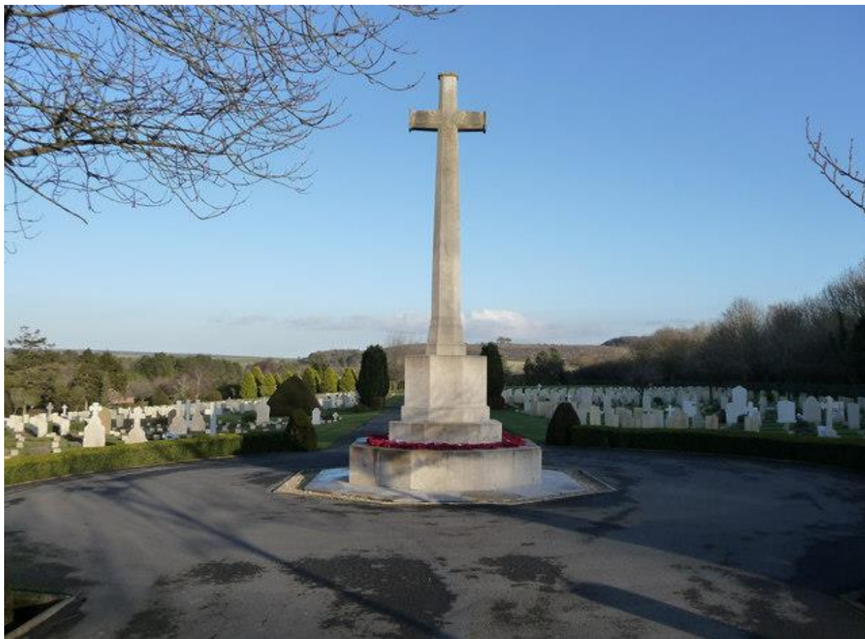
Tidworth Military Cemetery, Wiltshire