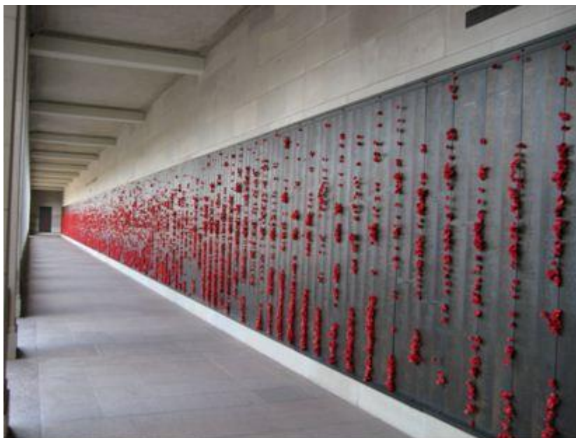
Roll Of Honour WW1 Australian War Memorial Canberra, Australia

Driver F. H. Cunliffe is commemorated on the Roll of Honour, located in the Hall of Memory Commemorative Area at the Australian War Memorial, Canberra, Australia on Panel 21.