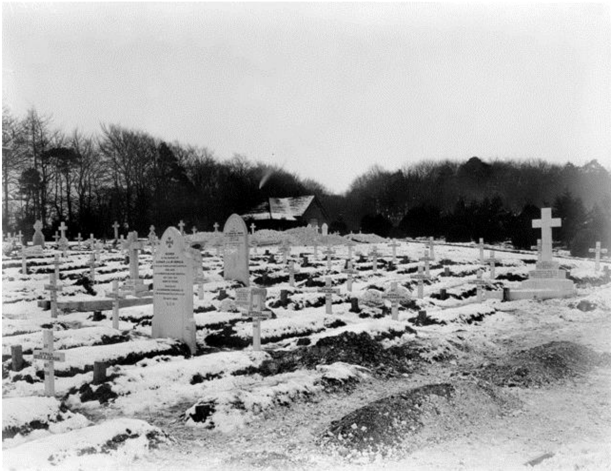
AUSTRALIAN WAR MEMORIAL