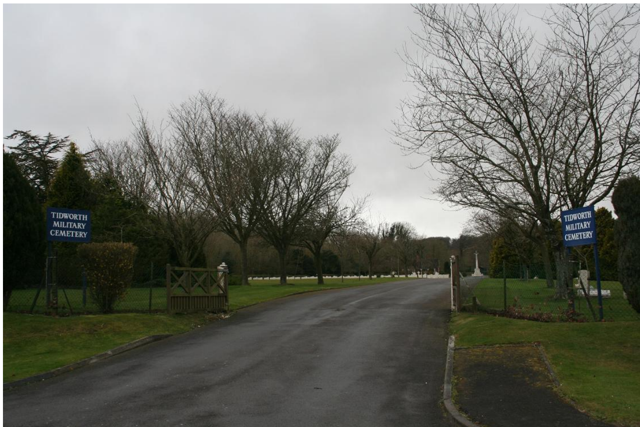
Tidworth Military Cemetery