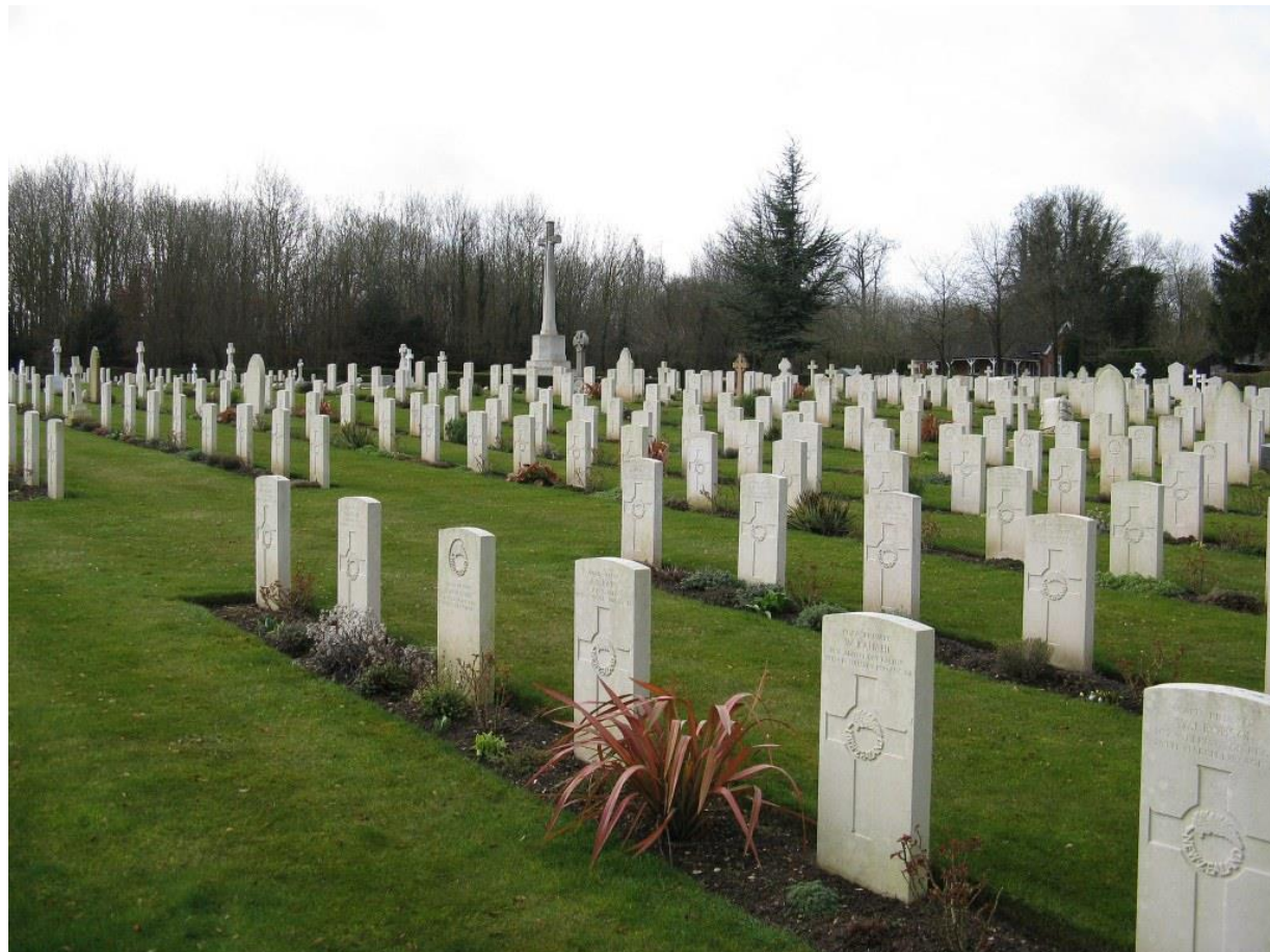
Tidworth Military Cemetery, Wiltshire