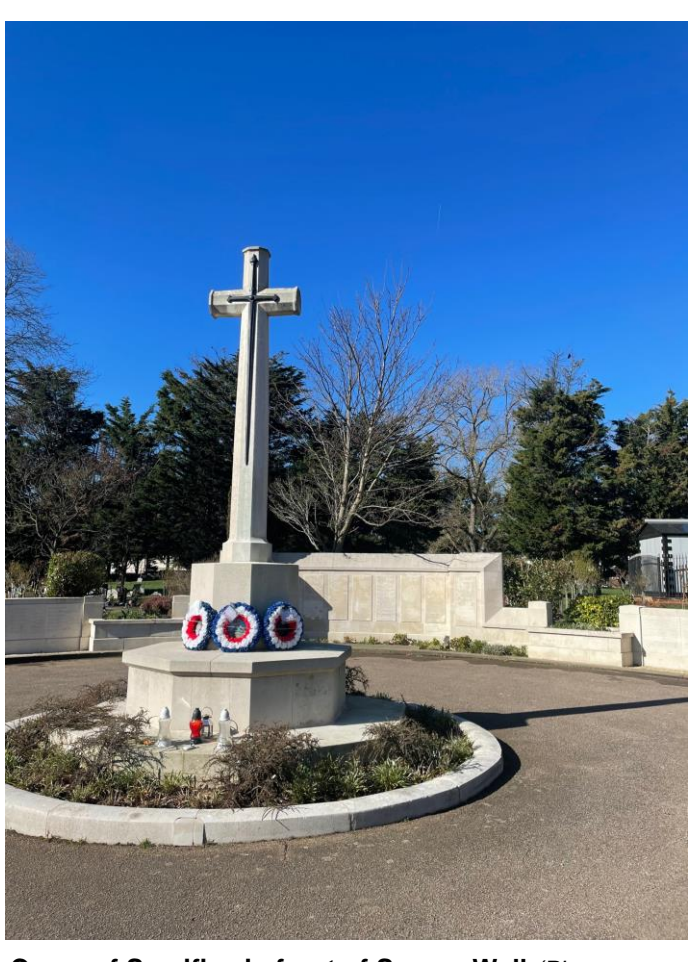
Screen Wall & (below) Cross of Sacrifice in front of Screen Wall