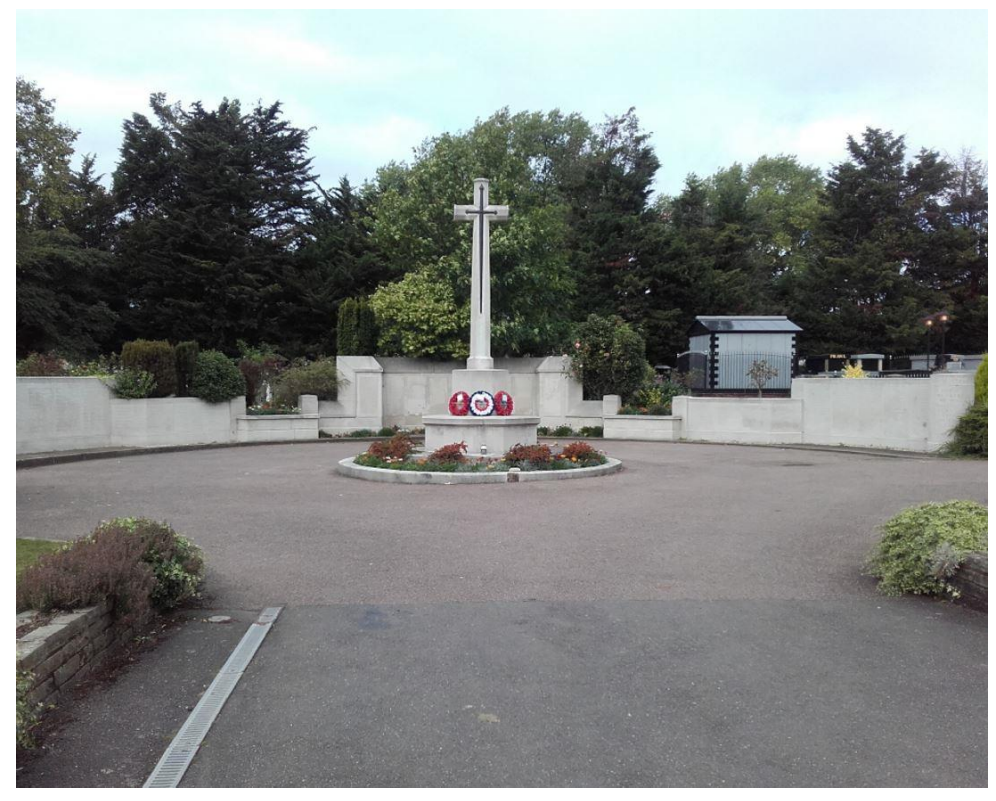
Cross of Sacrifice

Streatham Park Cemetery contains 408 Commonwealth War Graves – 118 relating to World War 1 & 290 relating to World War 2.