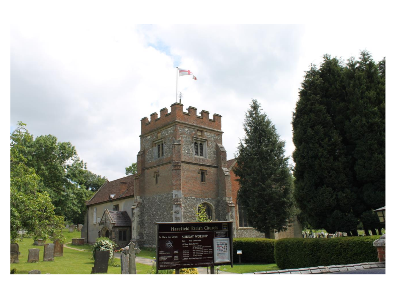
St Mary the Virgin Church, Harefield