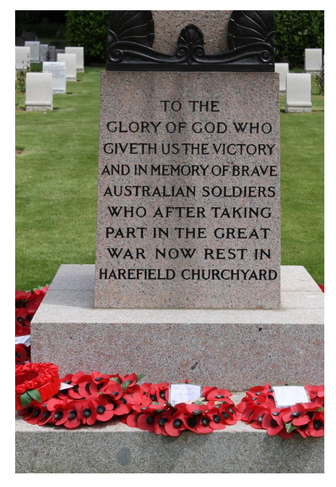
St. Mary the Virgin Churchyard, Harefield