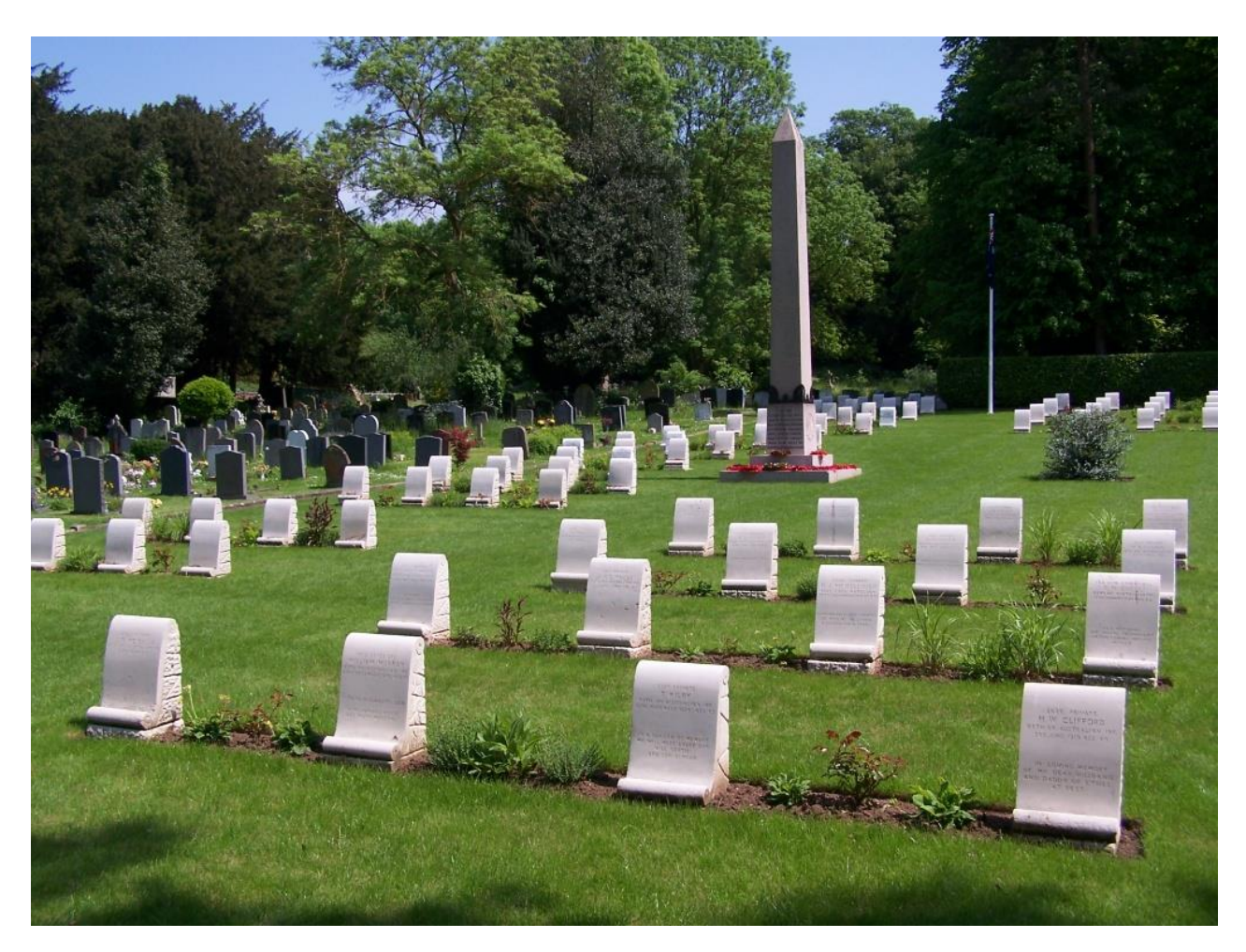
St. Mary the Virgin Churchyard, Harefield