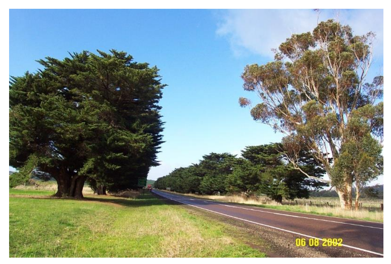
Coleraine Avenue of Honour

The Black Saturday bushfires of February 2009 destroyed 54 trees and a new Avenue of Honour was replanted in April 24th 2010 to honour all women and men who have served in conflicts.