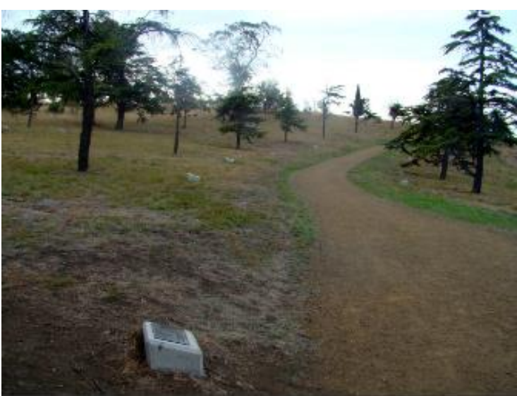
Soldiers Walk, Hobart