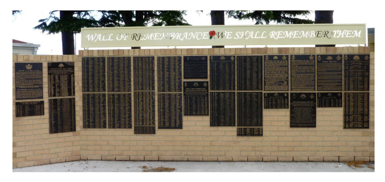
Wall of Remembrance, St. Helens, Tasmania

"What these men did nothing can alter now. The good and the bad, the greatness and the smallness of their story will stand. Whatever of glory it contains nothing now can lessen. It rises, as it will always rise, above the mists of ages, a monument to great hearted men; and for their nation, a possession forever."