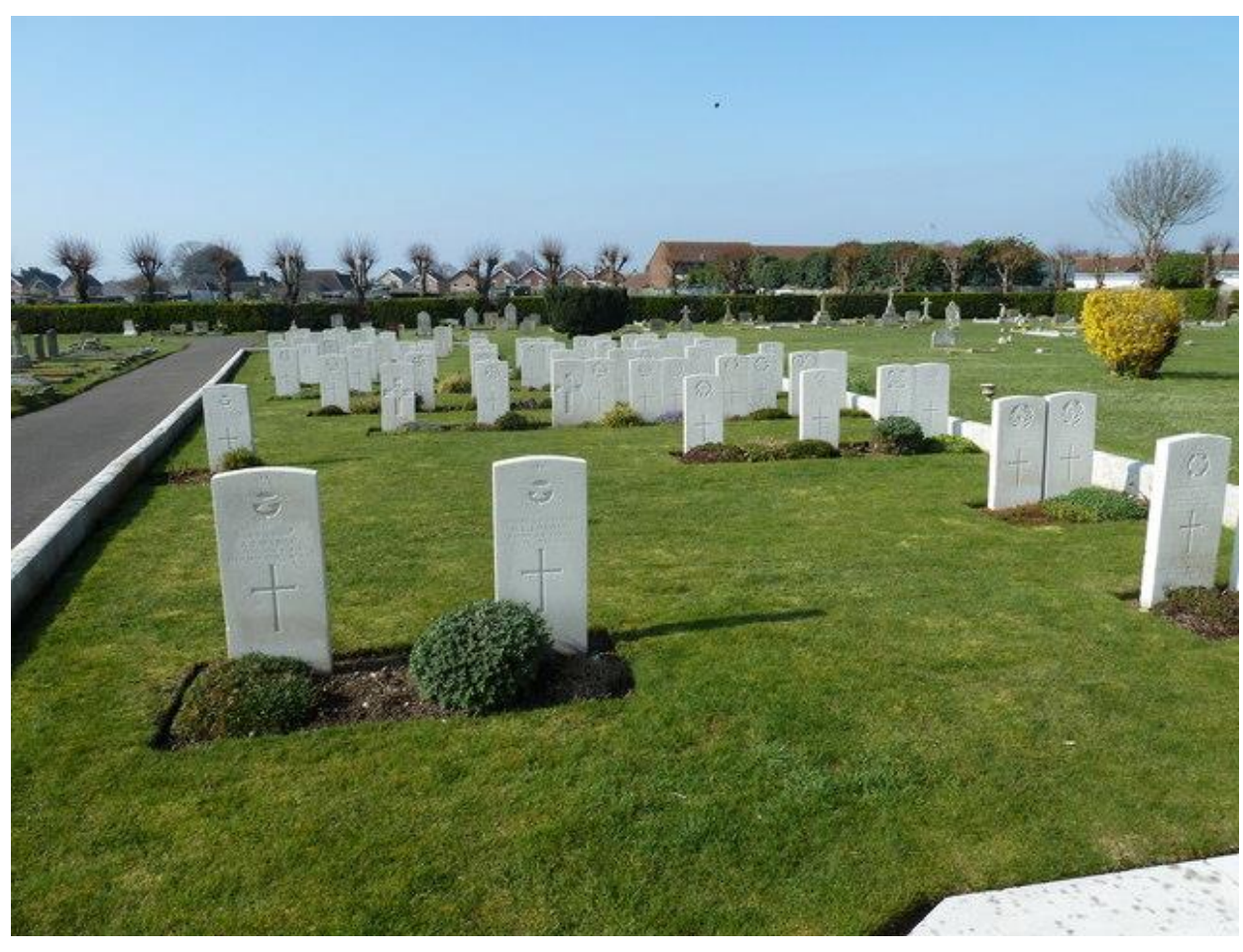
Some War Graves in Chichester Cemetery