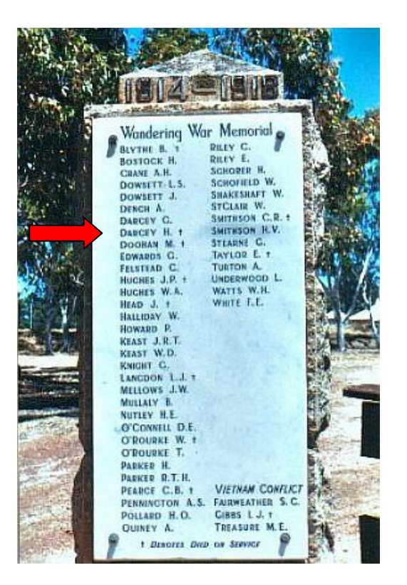
Wandering Memorial Gates