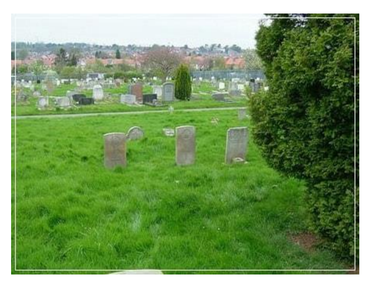
Normanton Cemetery