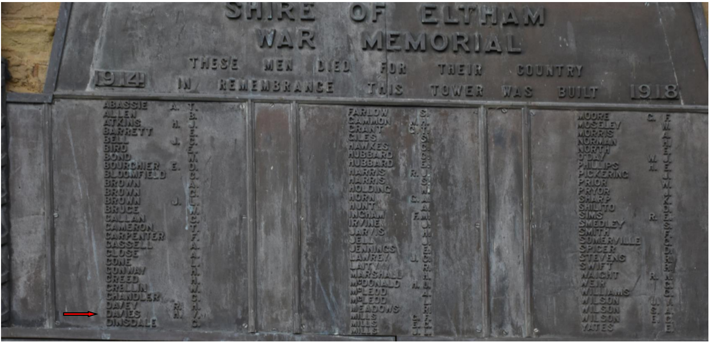
Shire of Eltham War Memorial