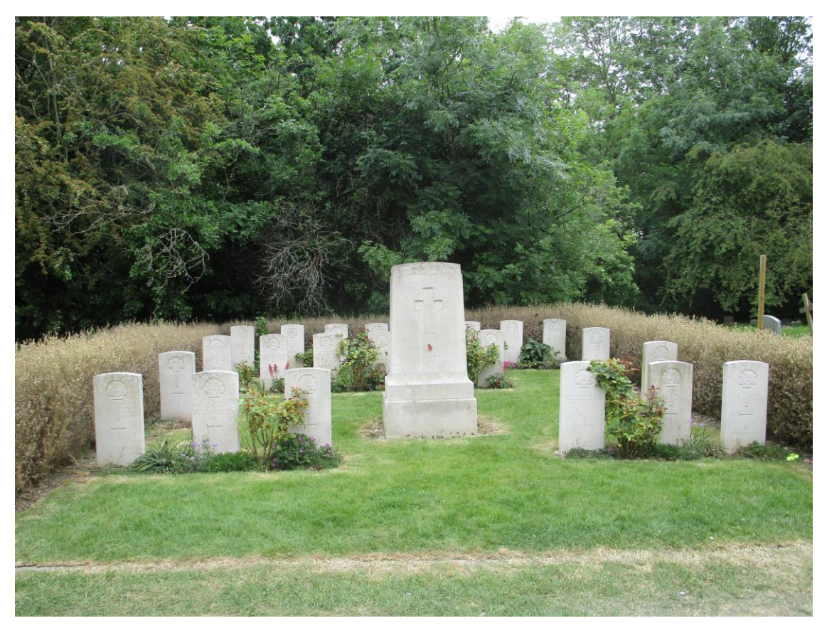
Australian War Graves in All Saints Cemetery, Nunhead