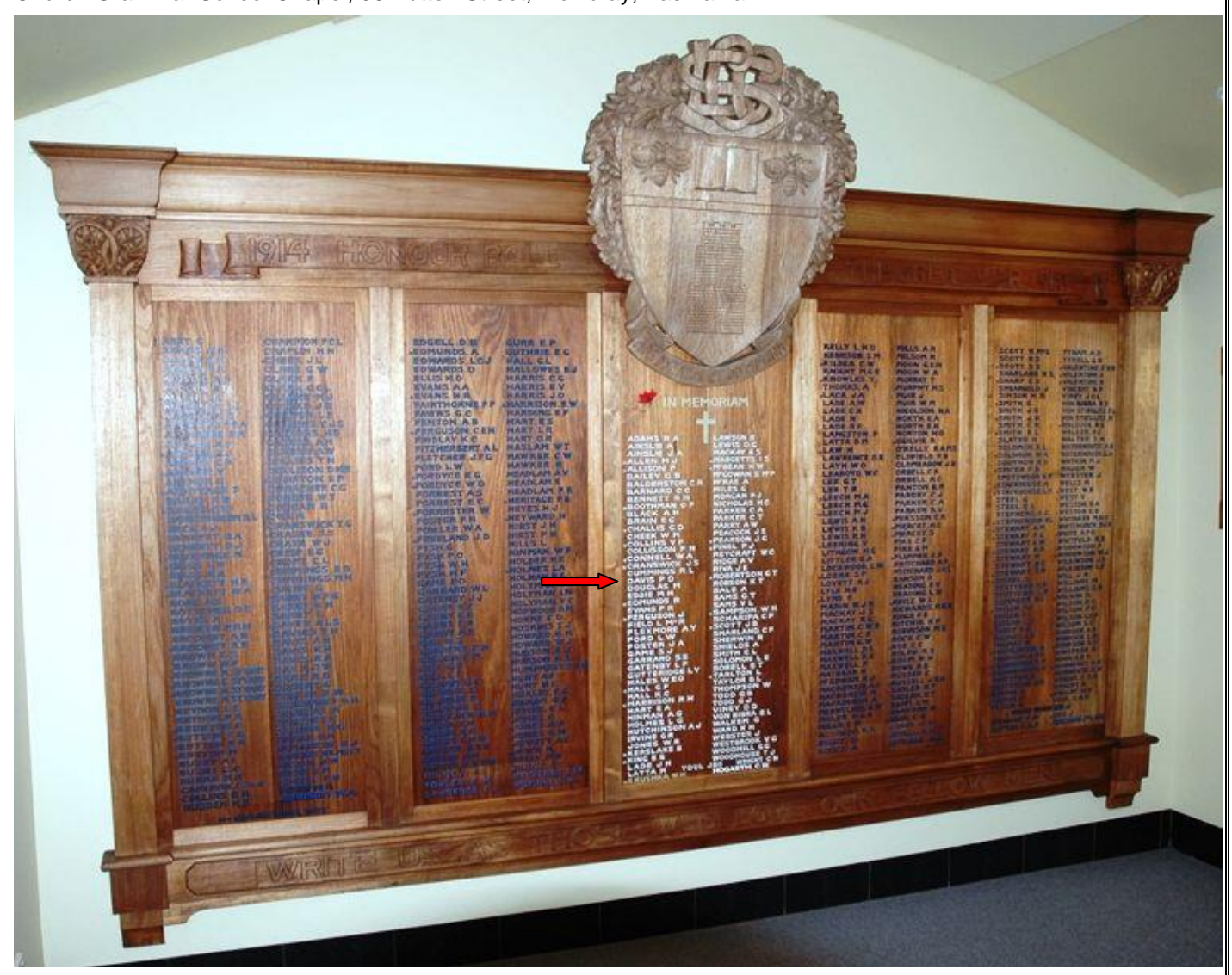
Launceston Church Grammar School Roll of Honour