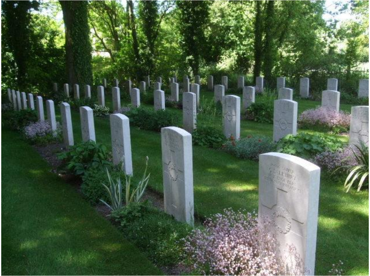
New Zealand Section of Codford Anzac War Graves Cemetery