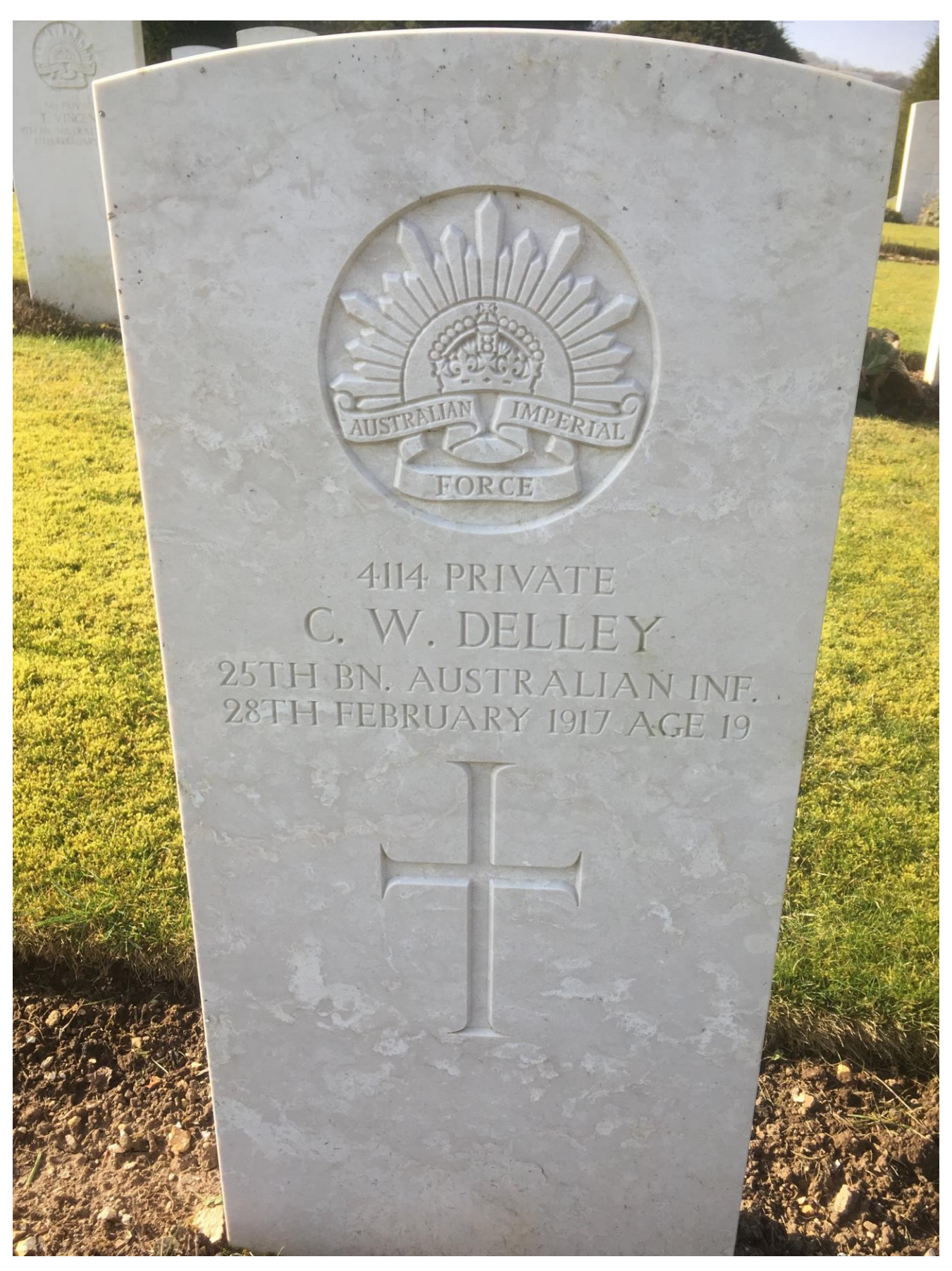
Photo of Private C. W. Delley's Commonwealth War Graves Commission Headstone in Tidworth Military Cemetery, Wiltshire, England.