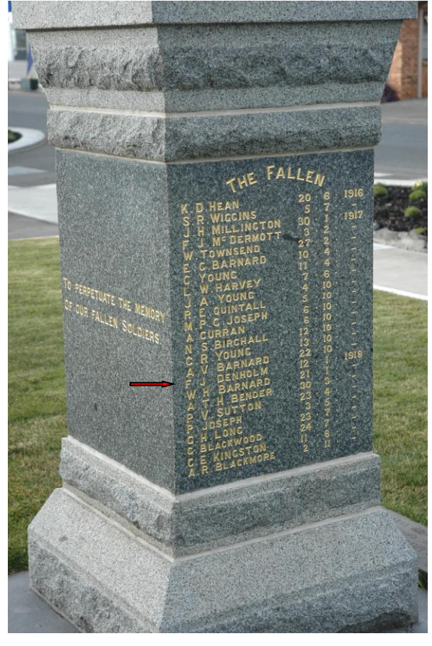
Sorell War Memorial