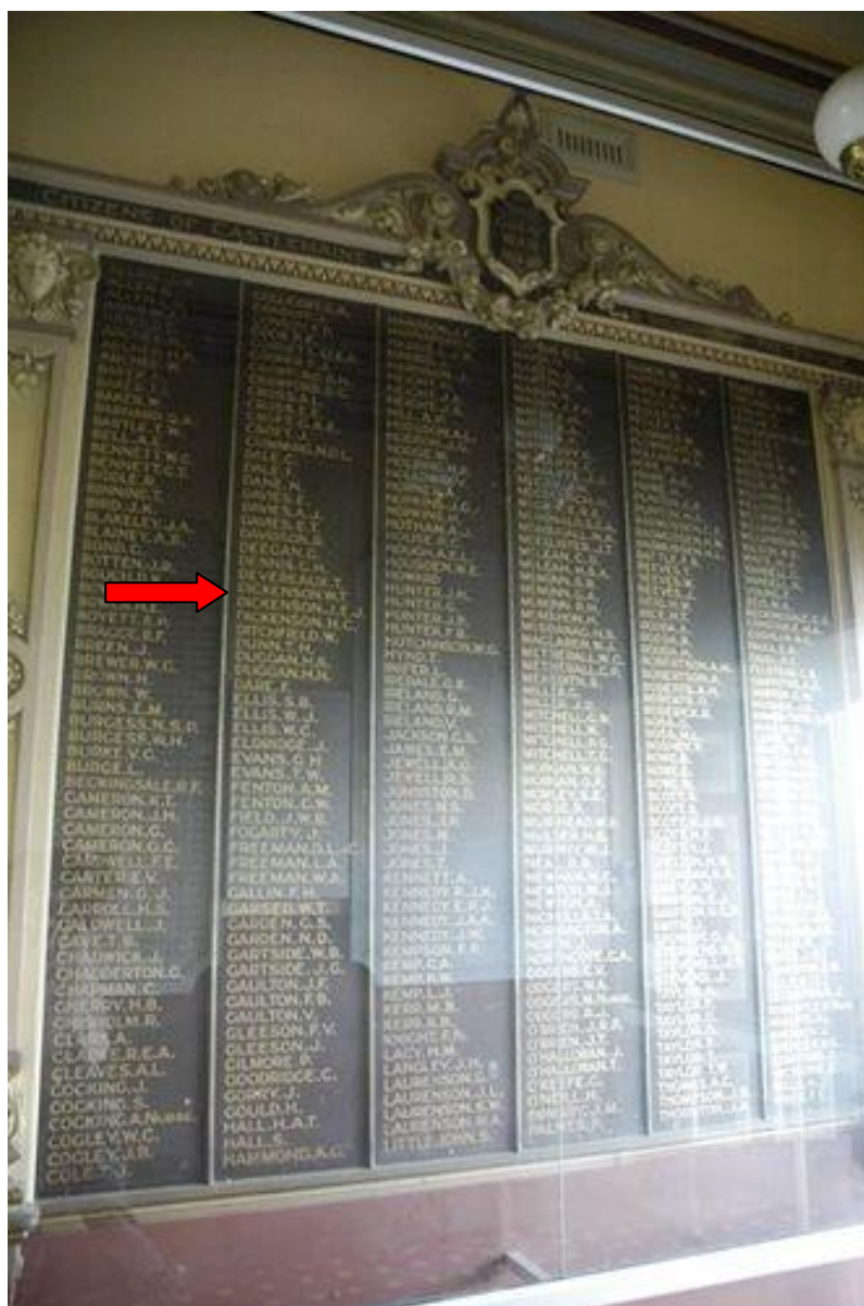
Castlemaine Town Hall Roll

W. T. Dickenson is also remembered on the Castlemaine Town Hall Roll of Honour located at 36 Mostyn Street, Castlemaine, Victoria. (Second Column, 24 th name down)