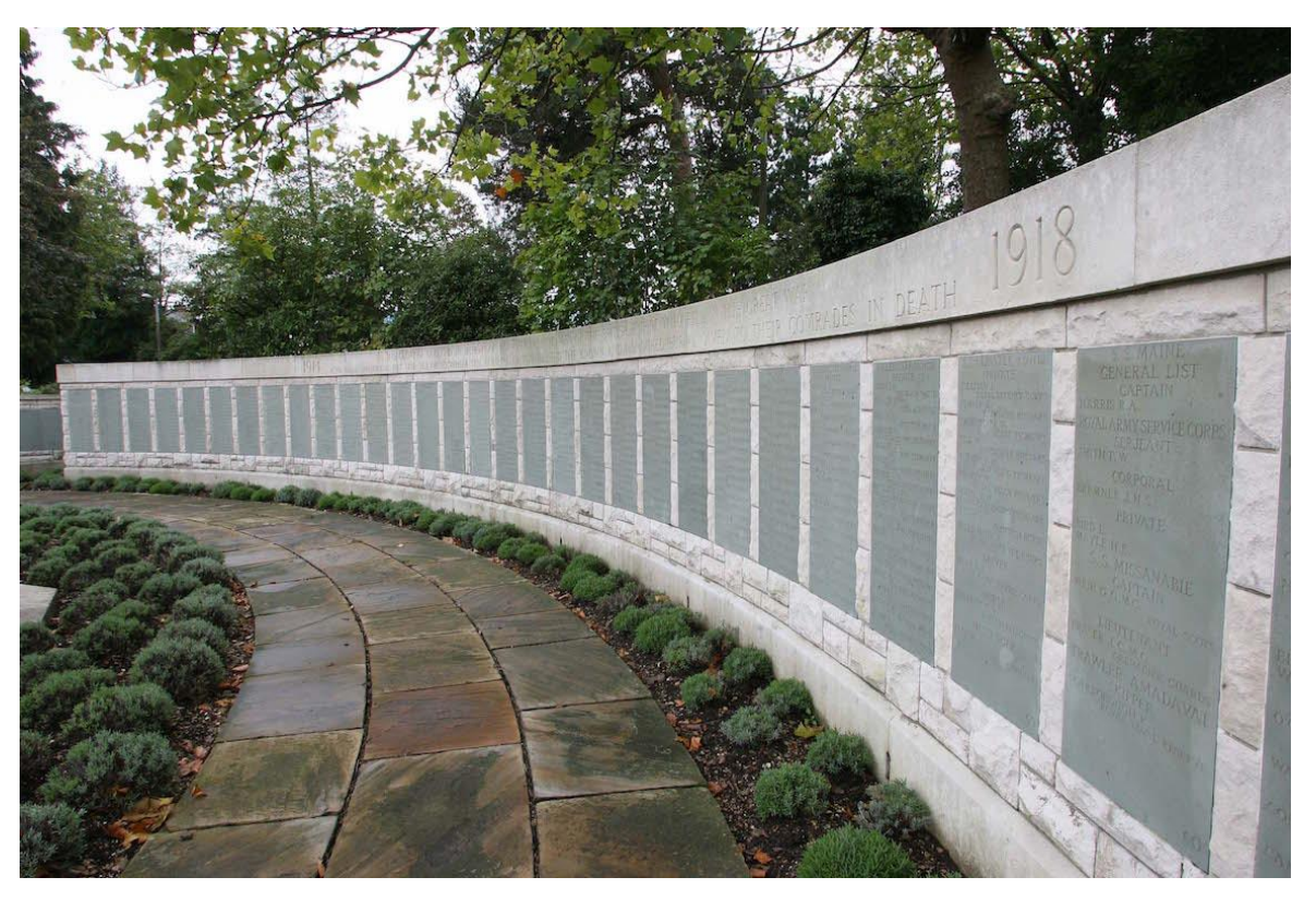
Name Panels behind Cross of Sacrifice