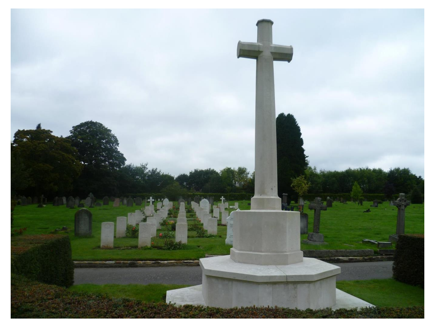
Cross of Sacrifice in Stoke Old Cemetery, Guildford

There are 4 Australians buried in this Cemetery.