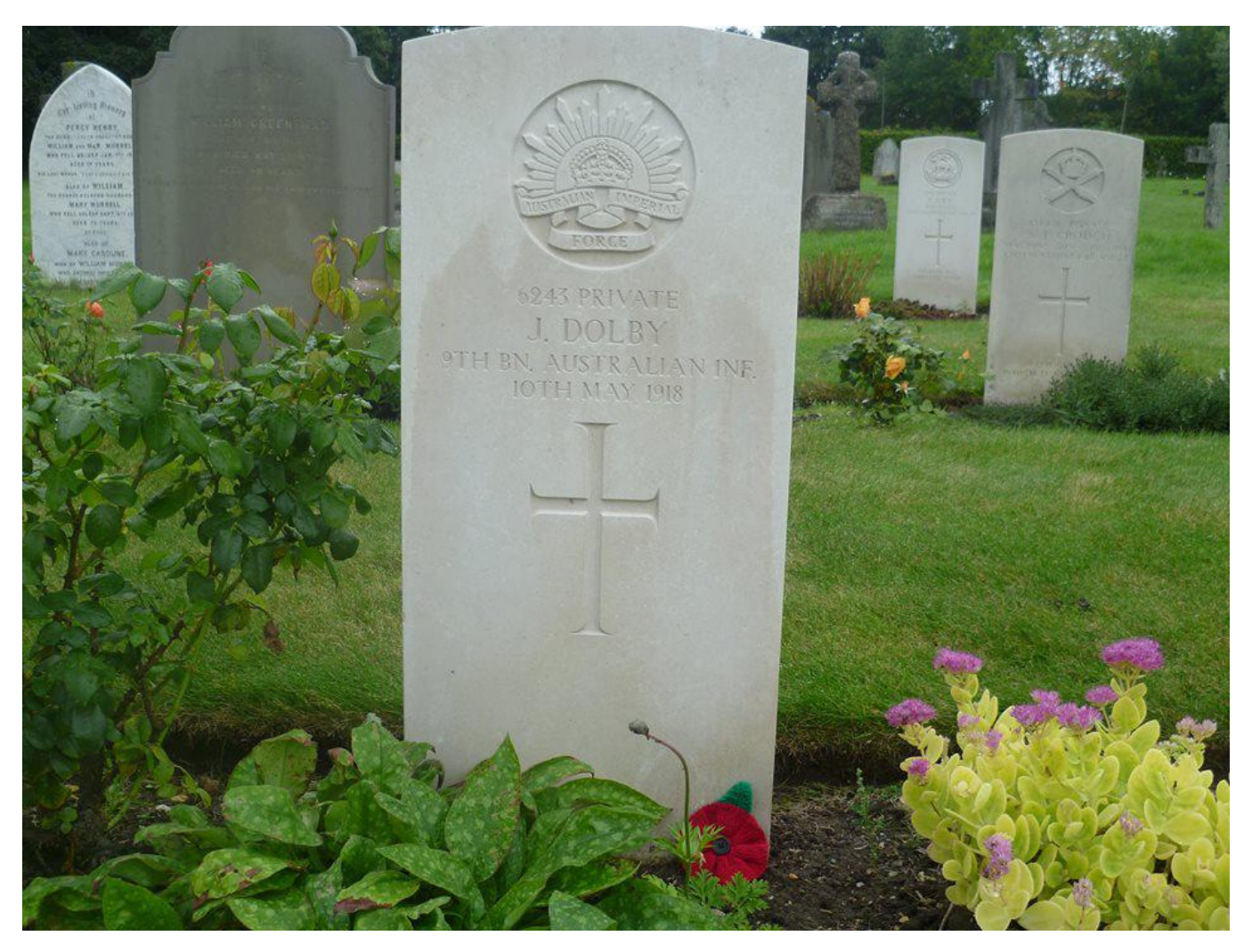
Photo of Private J. Dolby's Commonwealth War Graves Commission Headstone in Stoke Old Cemetery, Guildford, Surrey, England.