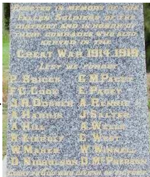
Baddaginnie War Memorial