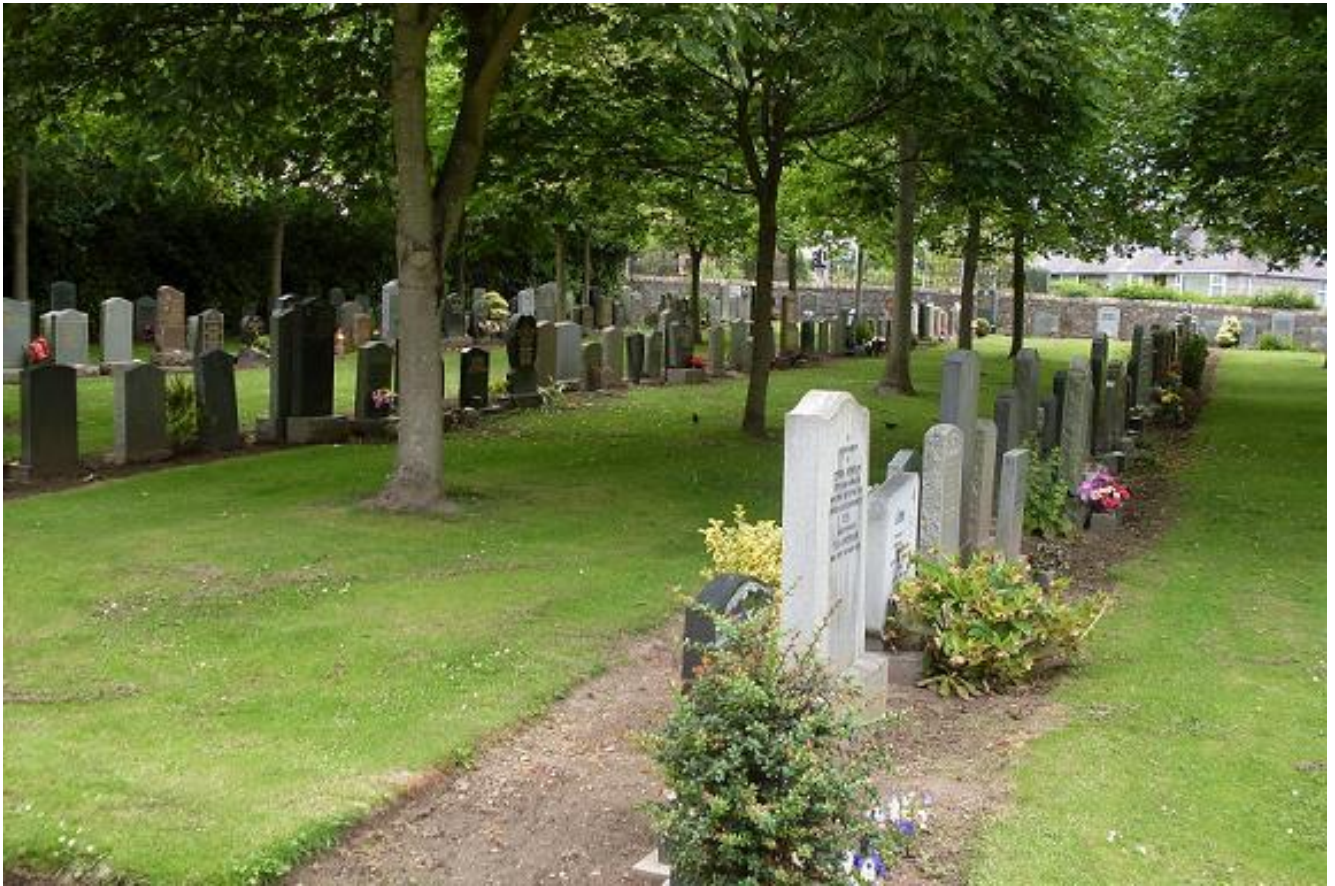
Springbank Cemetery, Aberdeen, Scotland