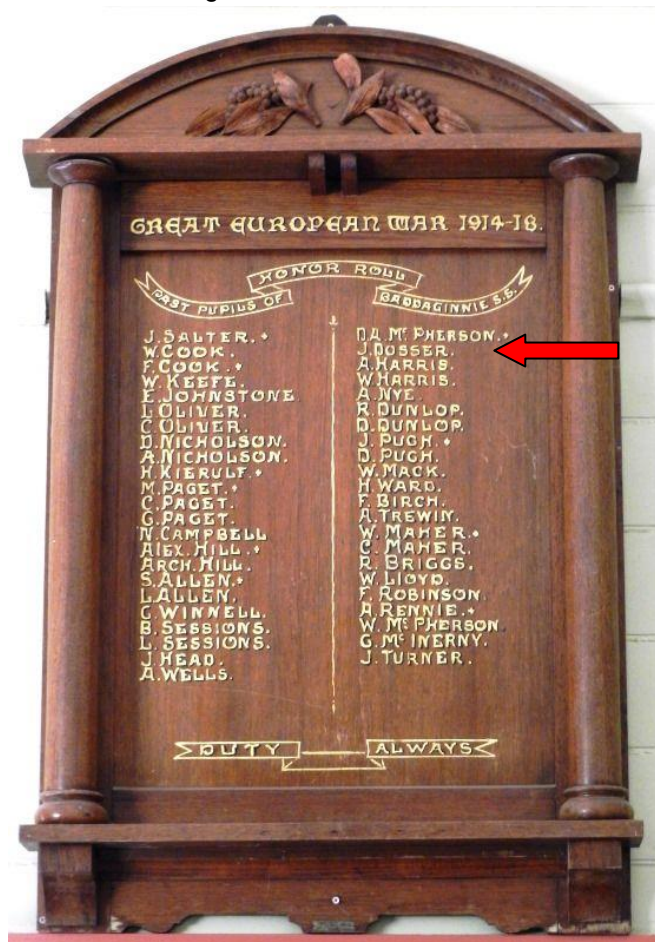
Baddaginnie State School Honour Roll