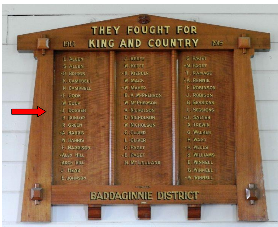
Baddaginnie District Honour Roll