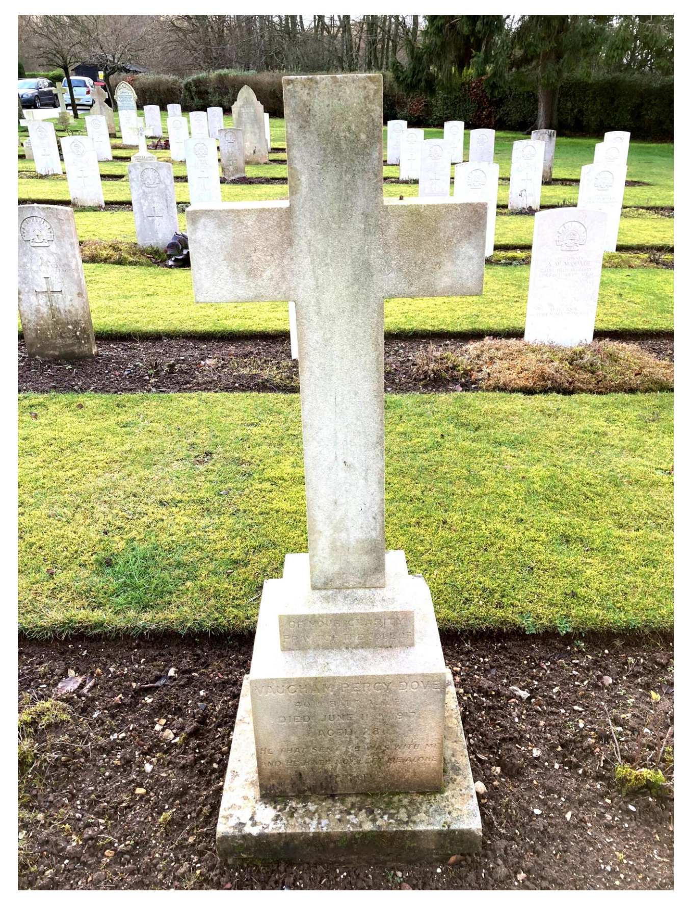
Photo of Private Vaughan Percy-Dove's Private Headstone in Tidworth Military Cemetery, Wiltshire, England.