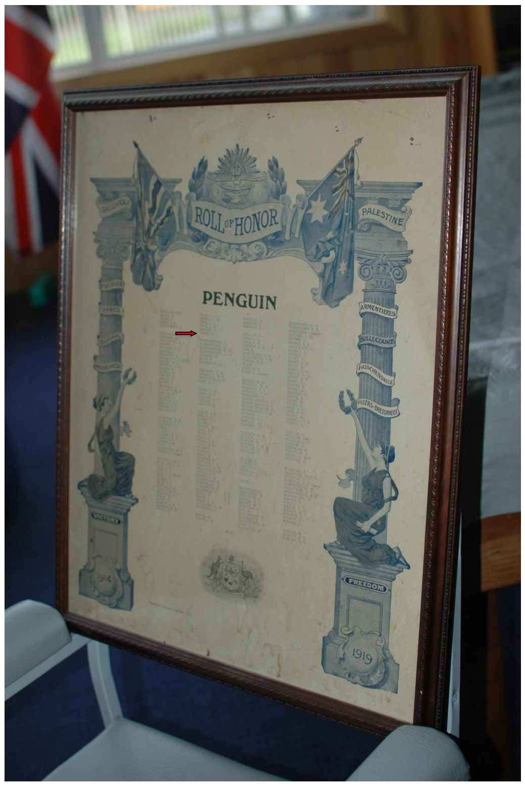
Penguin Roll of Honour

P. Dove is remembered on the Penguin Roll of Honour, located in Penguin Sports & Services Club, 11 Sports Complex Avenue, Penguin, Tasmania.