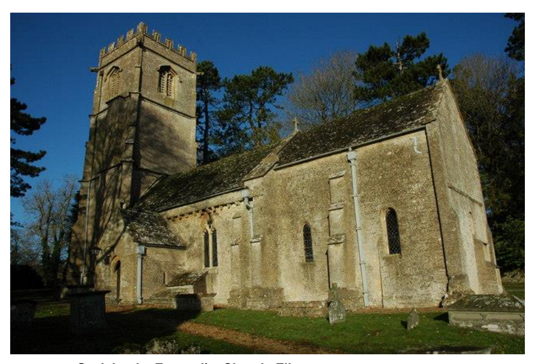
St. John the Evangelist Church, Elkstone

St. John the Evangelist Churchyard, Elkstone contains 2 Commonwealth War Graves – both from World War 1.