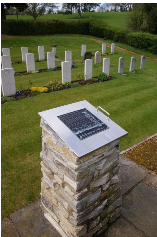
Left & right of Cemetery with central Plinth