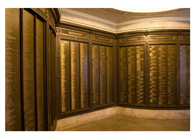
National War Memorial - Adelaide