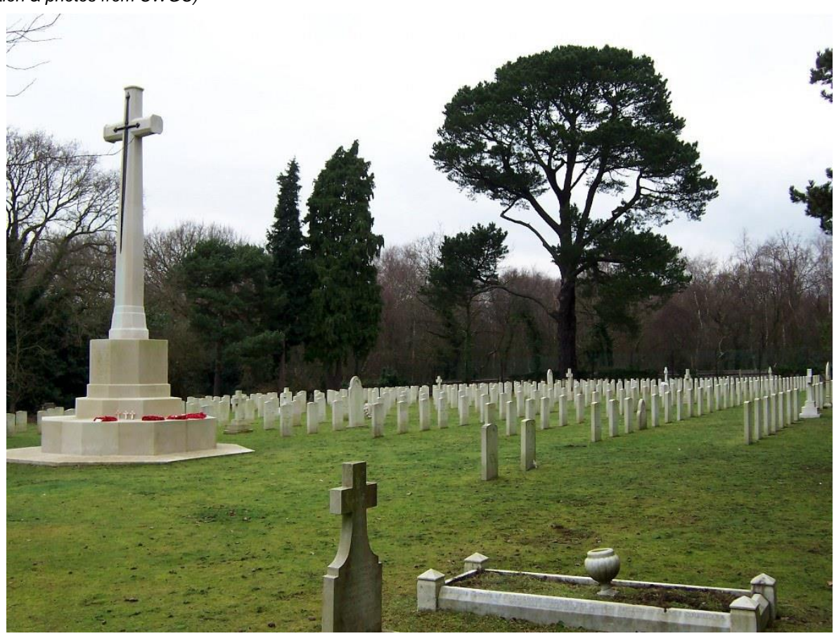
Netley Military Cemetery, Hampshire