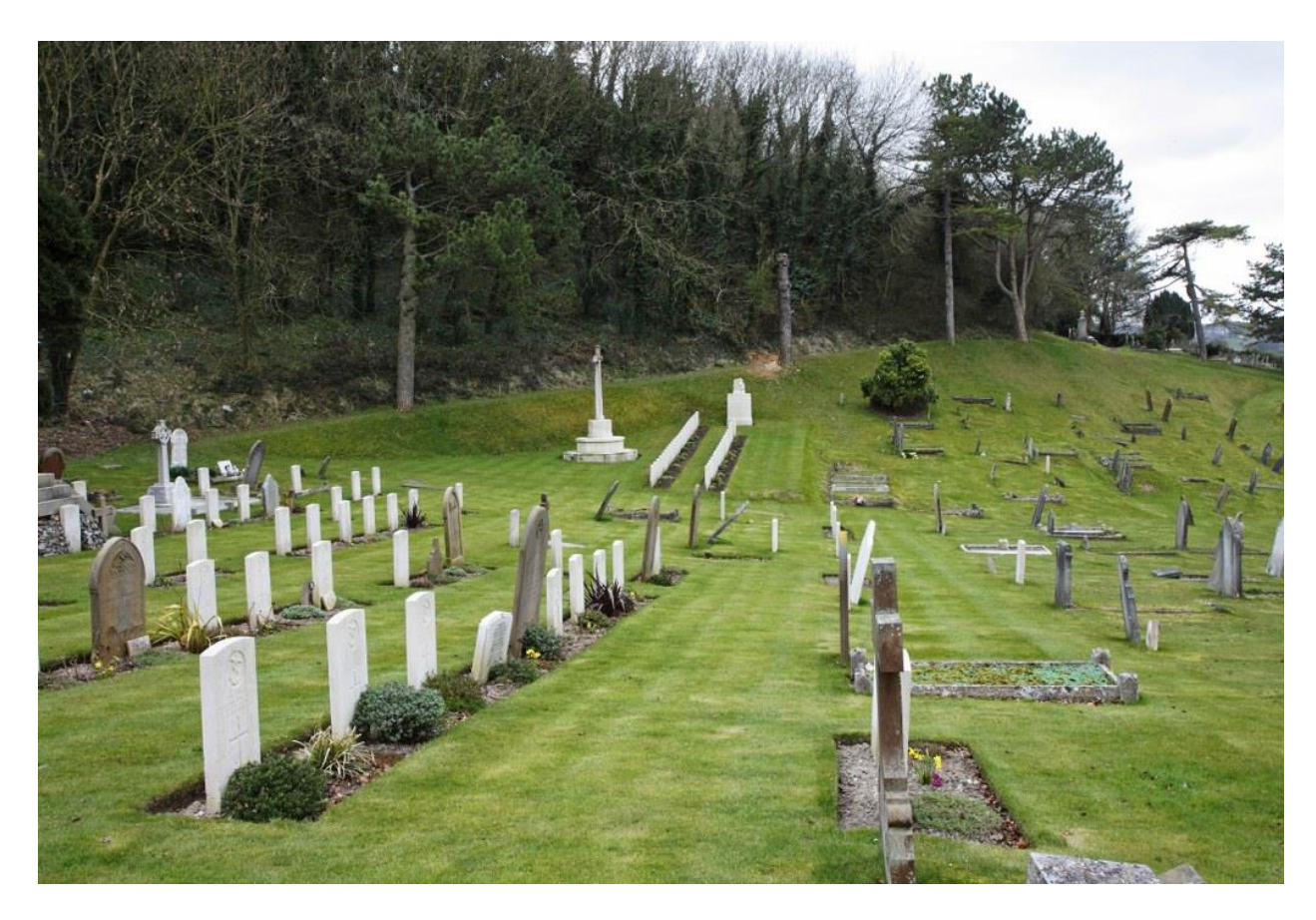
St. James Churchyard Cemetery, Dover