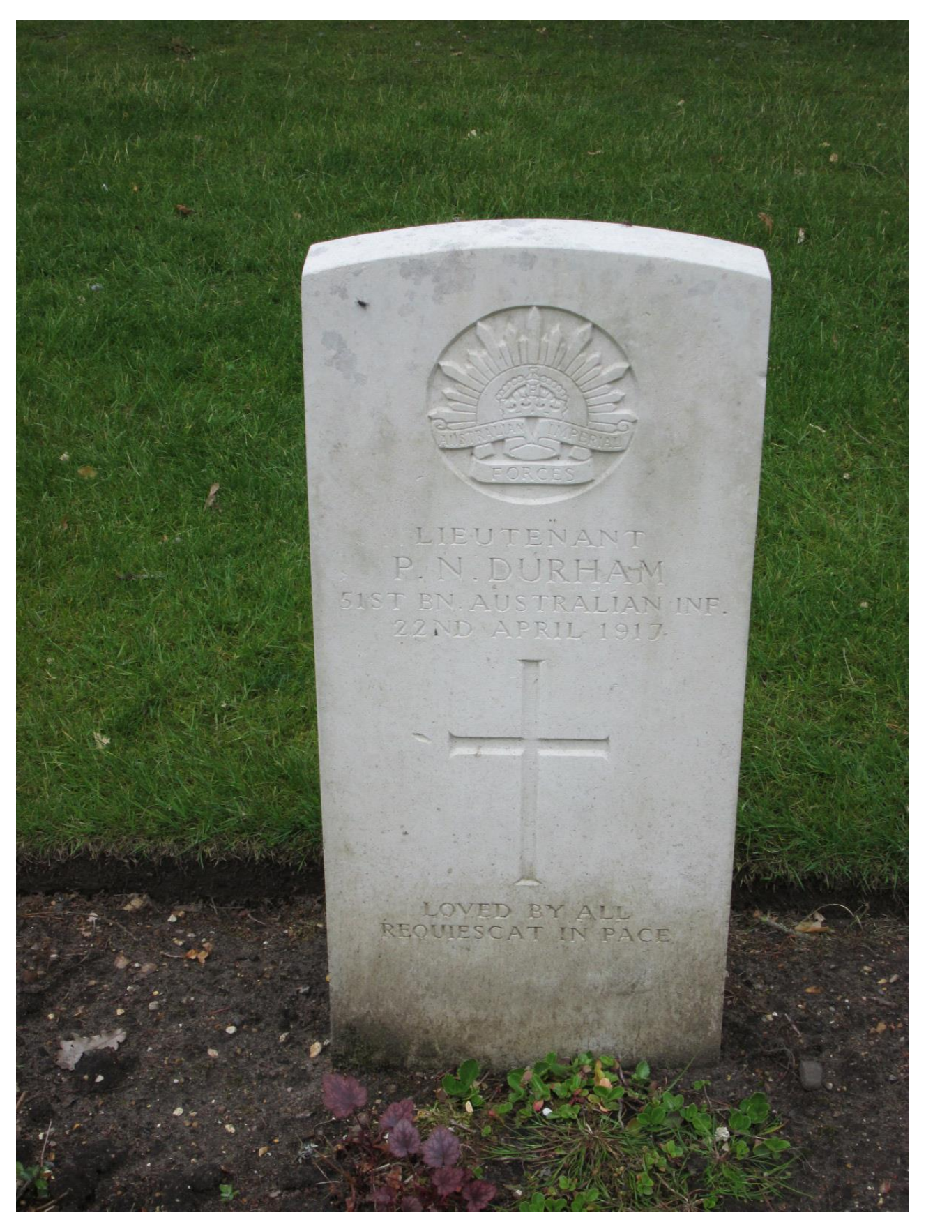
Photo of Lieutenant P. N. Durham's Commonwealth War Graves Commission Headstone in Brookwood Military Cemetery, Surrey, England.