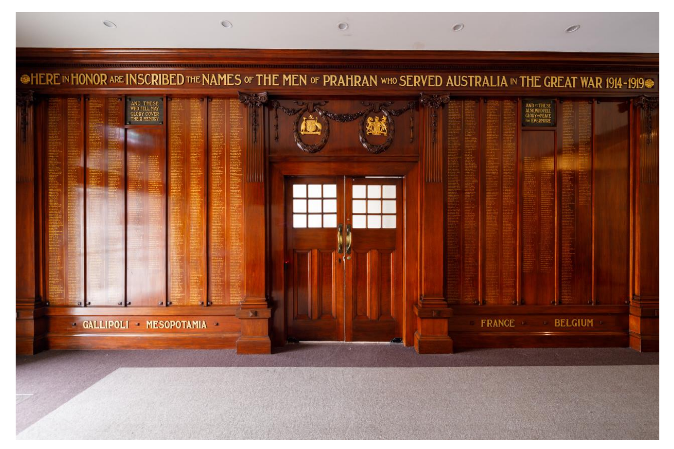
Prahran RSL Honour Roll

P. N. Durham is remembered on the Prahran RSL Honour Roll, located at High Street, Prahran, Victoria.