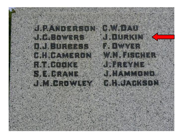
Kilmore War Memorial