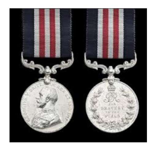
Military Medal (MM)

The Military Medal (MM) was a military decoration awarded to personnel of the British Army and other arms of the armed forces, and to personnel of other Commonwealth countries, below commissioned rank, for bravery in battle on land. The award was established in 1916, with retrospective application to 1914, and was awarded to other ranks for "acts of gallantry and devotion to duty under fire". ( Wikipedia )