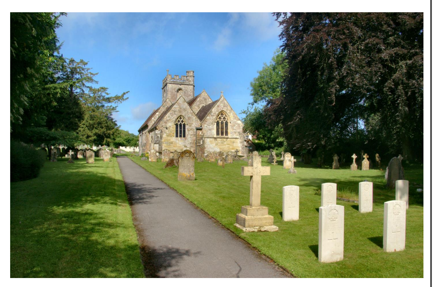
St George's Churchyard, Fovant – War Graves at front & rear