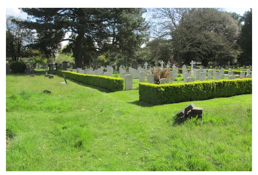
Bournemouth East Cemetery