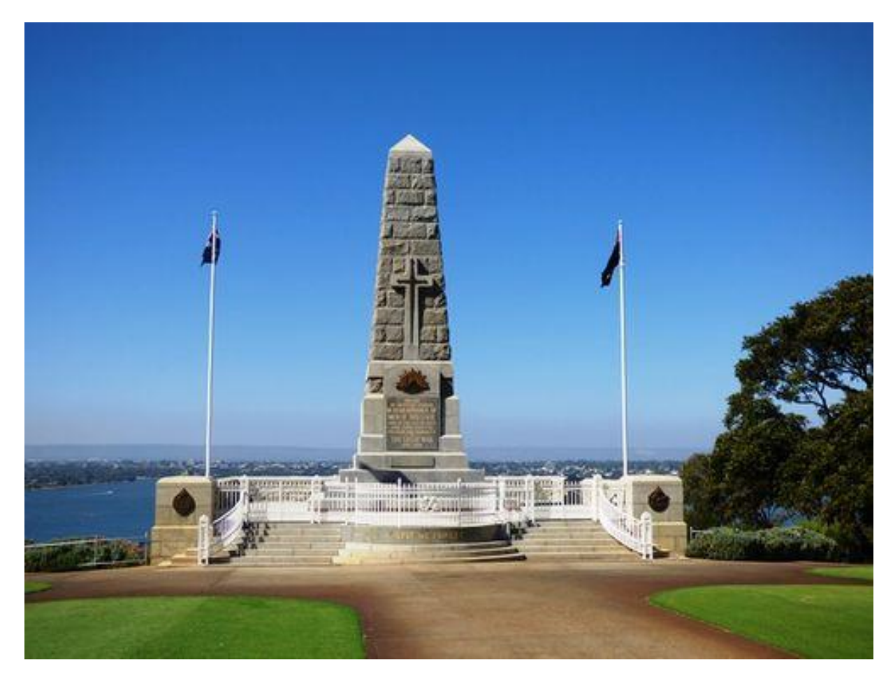
Western Australia State War Memorial Cenotaph, Kings Park

The heavy concrete foundations are supplemented by heavy brick walls which enclose an inner chamber or crypt. The walls surrounding the crypt are covered with The Roll of Honour; marble tablets which list under their units the names of more than 7,000 members of the services killed in action or as a result of World War One.