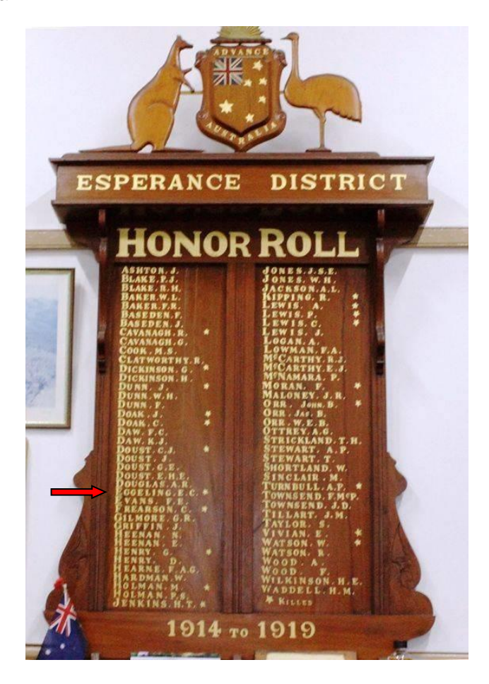
Esperance District Honour Roll

E. C. Eggeling is remembered on the Esperance District Honour Roll, located in RSL Hall, Dempster Street, Esperance, Western Australia.