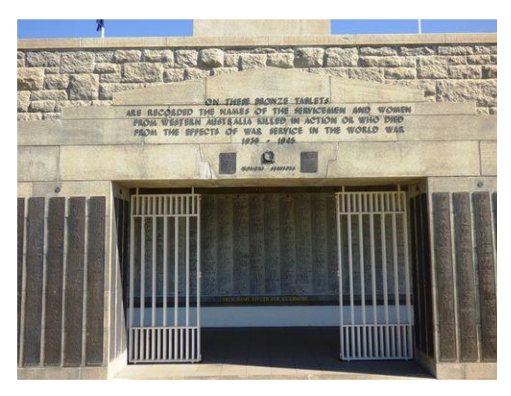
The Crypt with the Roll of Honour names