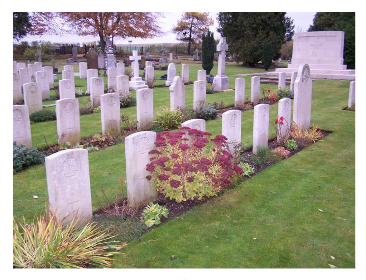
Durrington Cemetery, Wiltshire