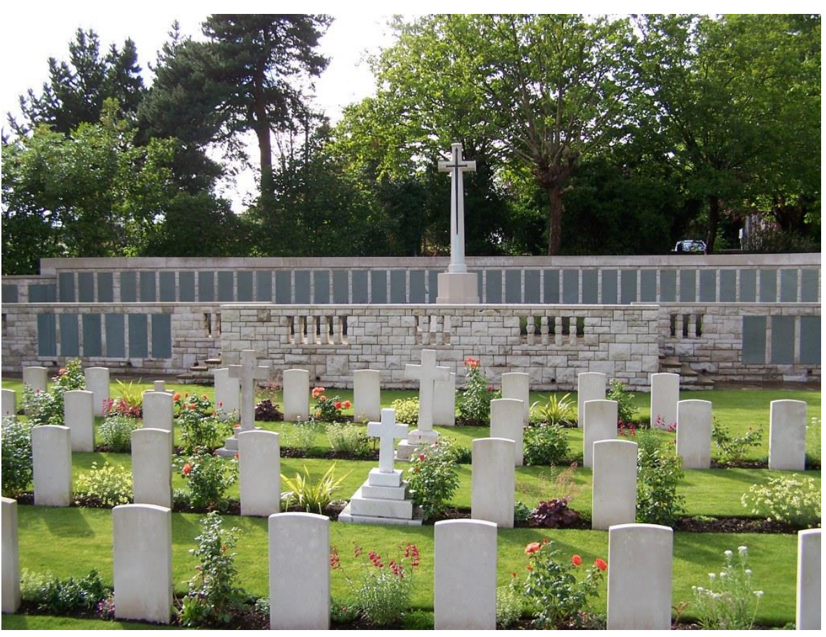
CWGC Graves in Hollybrook Cemetery with Cross of Sacrifice & Hollybrook Memorial