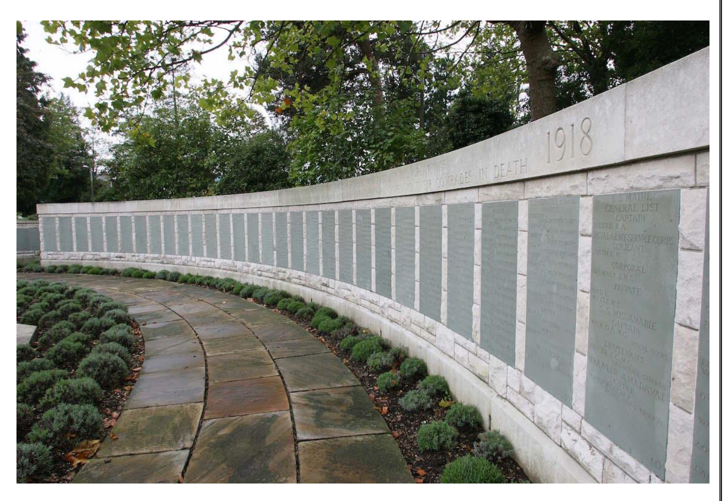
Name Panels behind Cross of Sacrifice