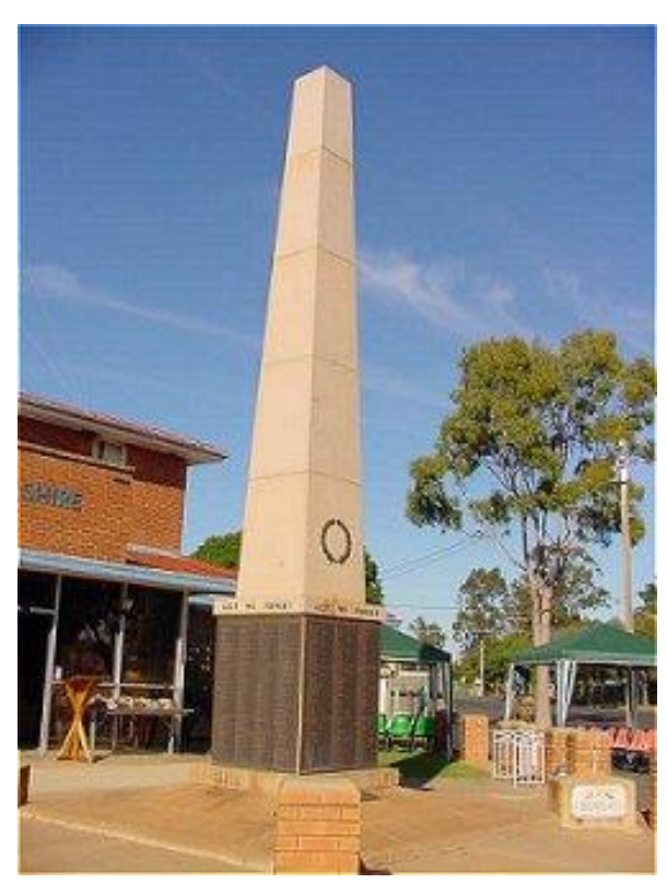
Nyngan & District War Memorial