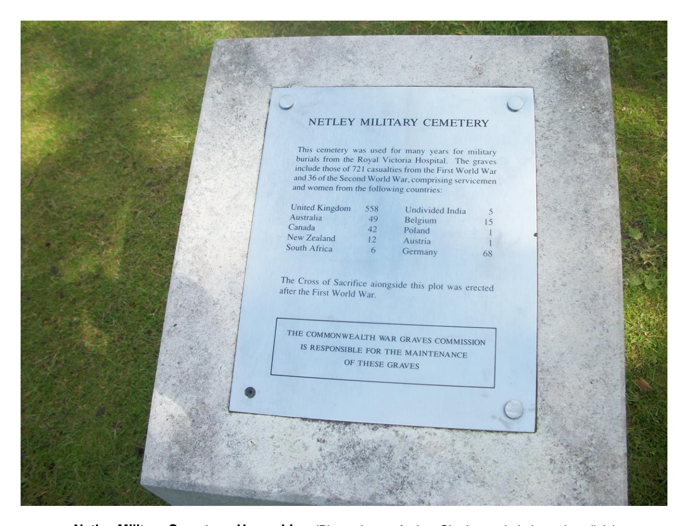
Netley Military Cemetery, Hampshire