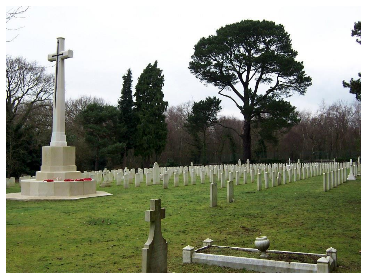
Netley Military Cemetery, Hampshire