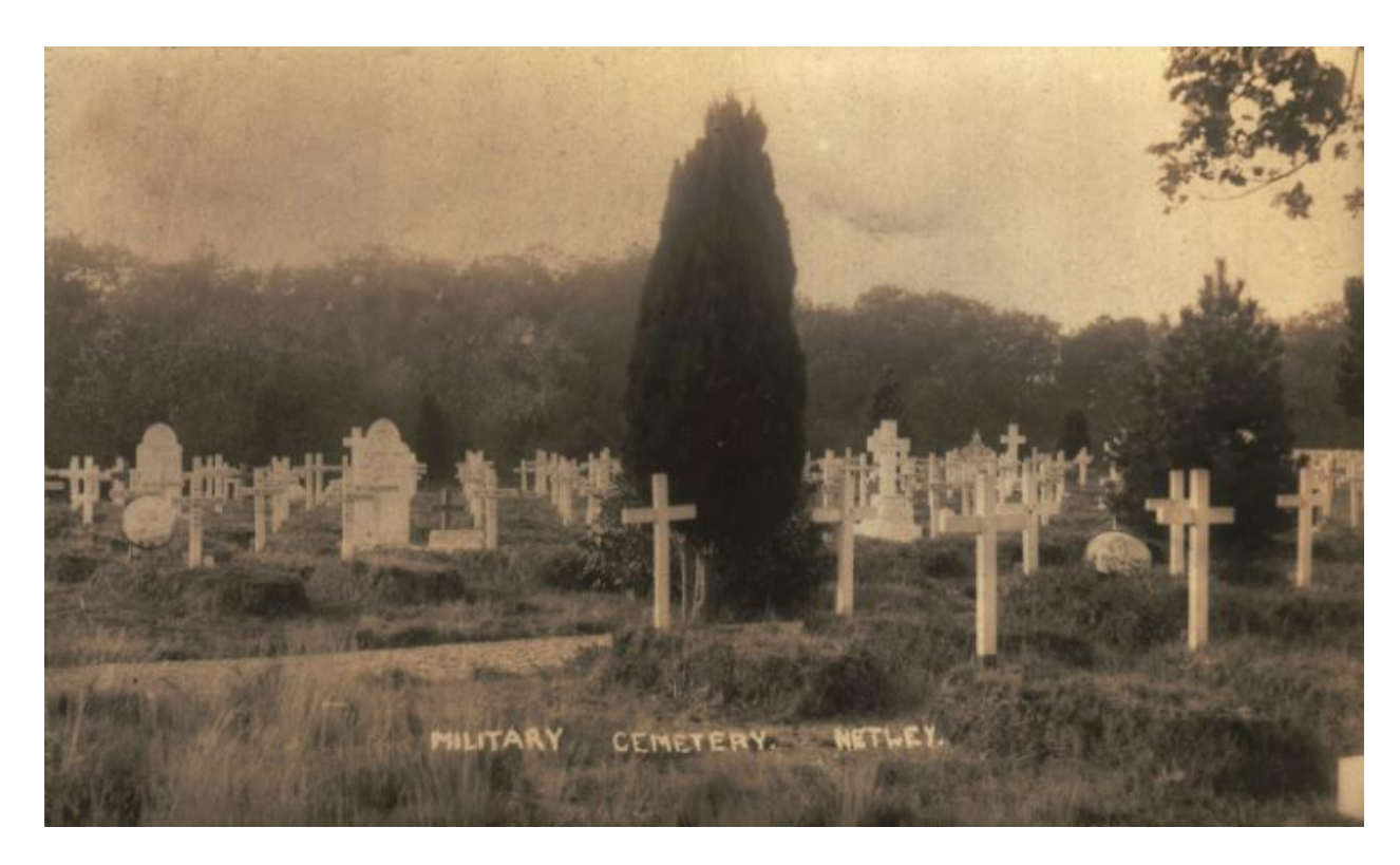
Original Cross markers - Netley Military Cemetery