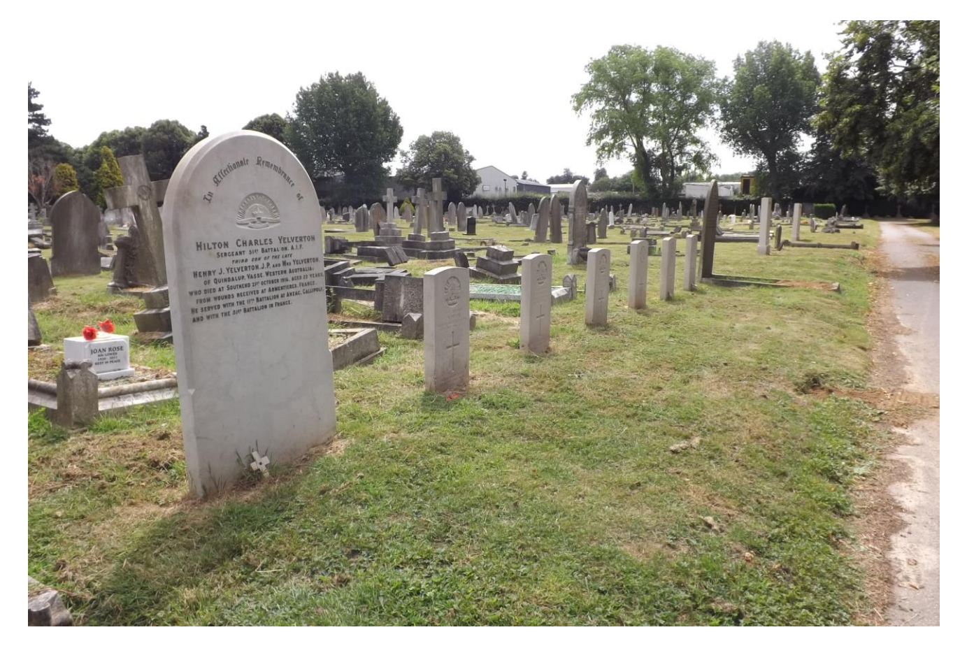
Row of 7 Australian WW1 Headstones