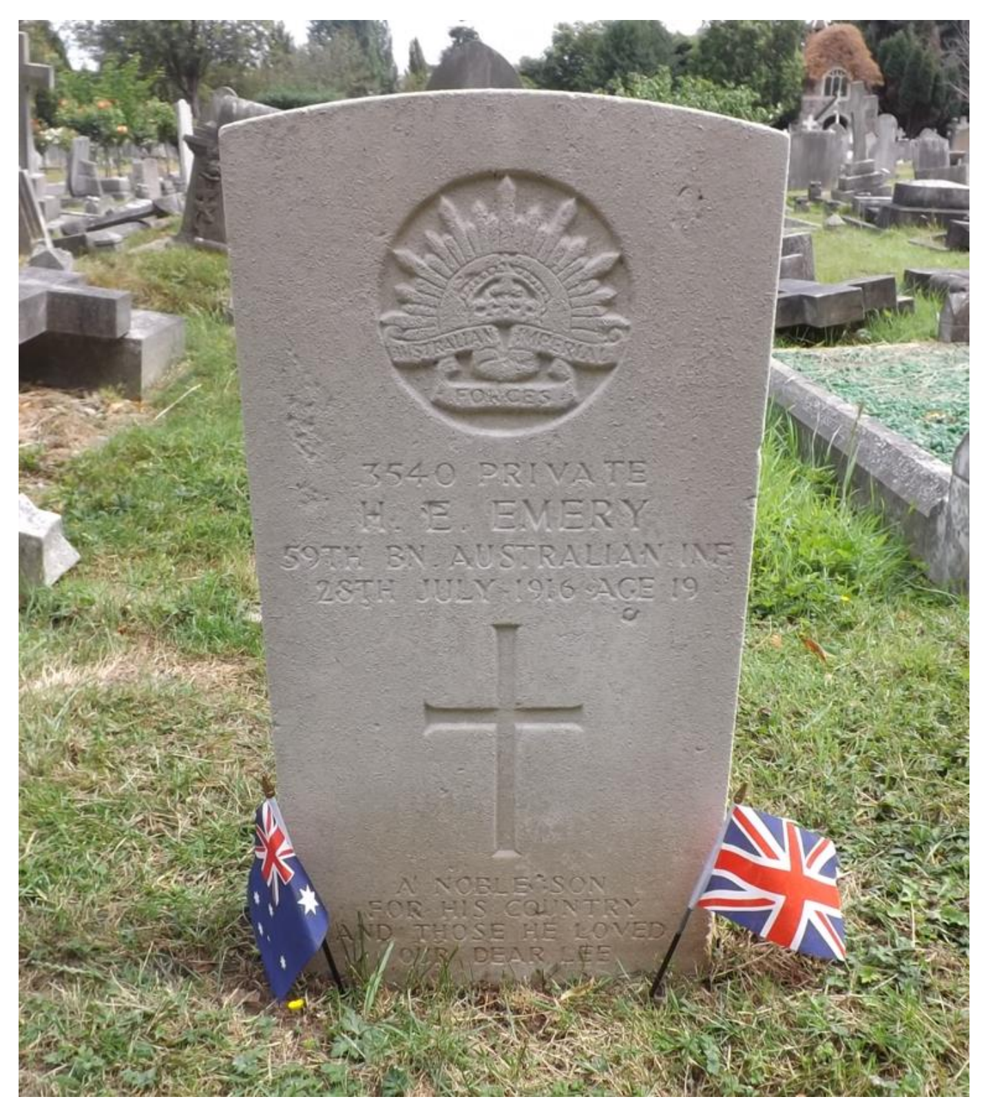
Photo of Private H. E. Emery's Commonwealth War Graves Commission Headstone in Sutton Road Cemetery, Southend-On-Sea, Essex, England.