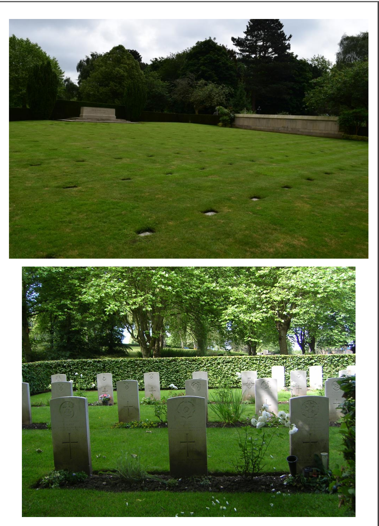
WW2 Garden of Remembrance