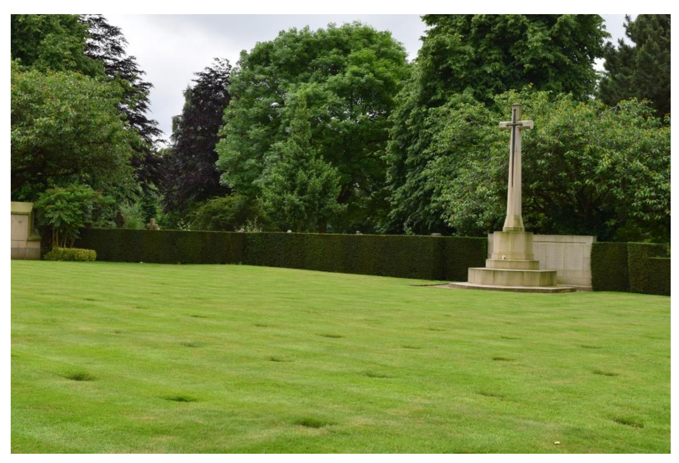
Lodge Hill Cemetery, Birmingham