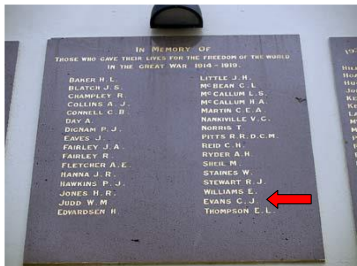
Mittagong and District War Memorial