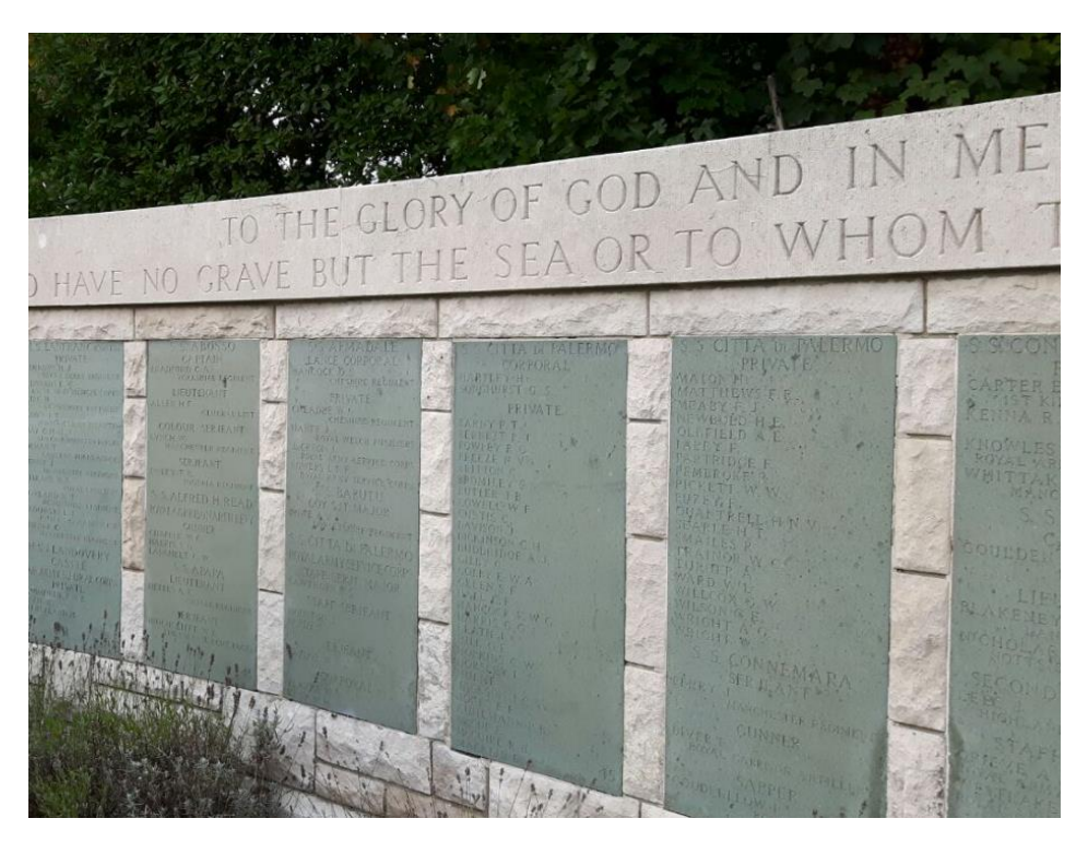
Name Panels behind Cross of Sacrifice