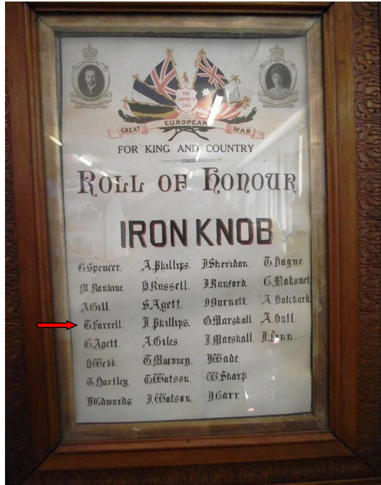
Iron Knob Roll of Honour