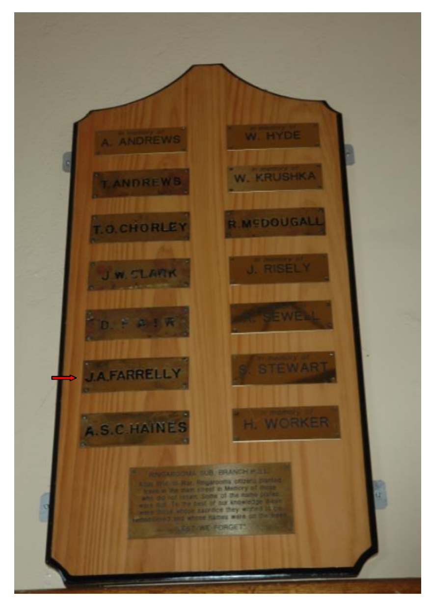
Ringarooma Memorial Avenue Tree Plaques

The plaque contains some of the original name plates that were attached to the trees in the Avenue of Honour in the main street. The trees were planted in 1919 in memory of the fallen from the district.