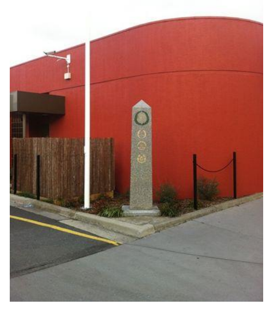
Yarraville Cenotaph

The Yarraville Cenotaph, located at Yarraville Club, 135 Stephen Street, Yarraville, Victoria does not list individual names.