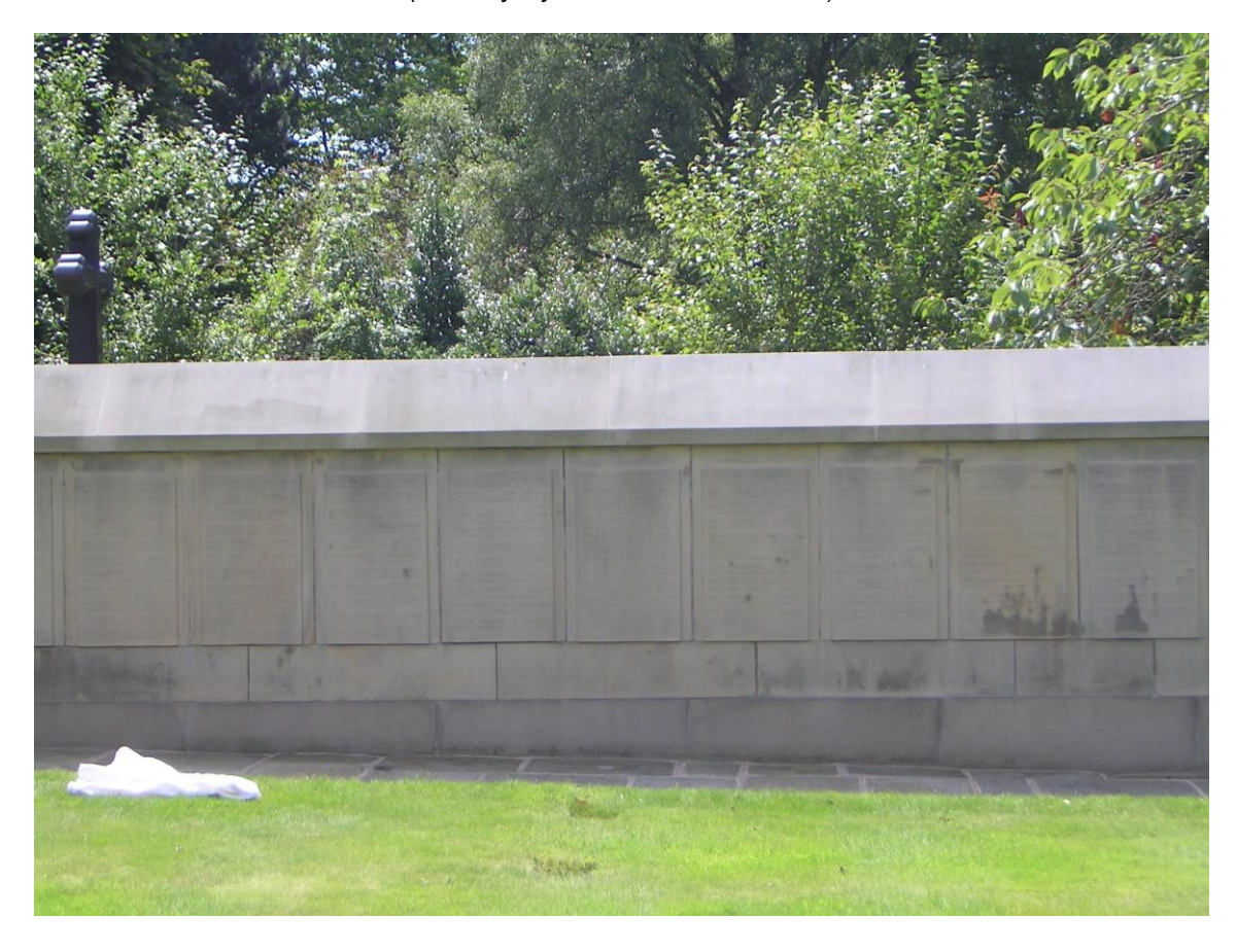
WW1 Screen Wall in Garden of Remembrance