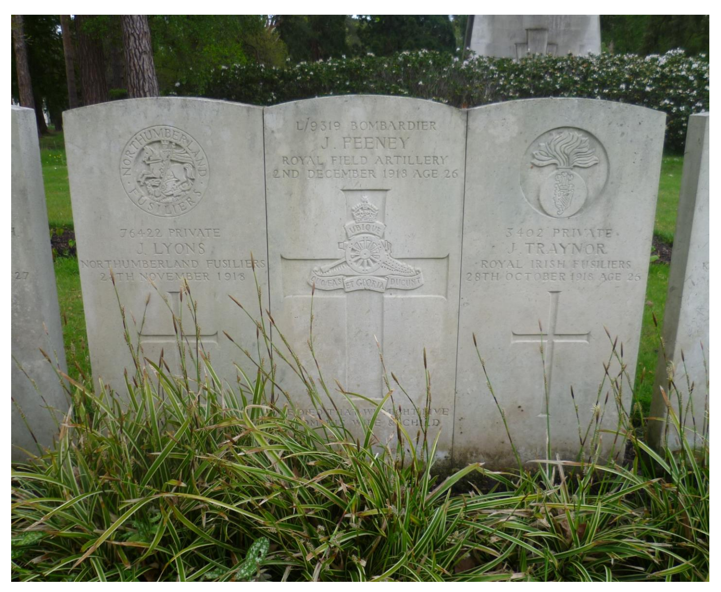
Photo of Bombardier J. Feeney's Commonwealth War Graves Commission Headstone in Brookwood Military Cemetery, Surrey, England.