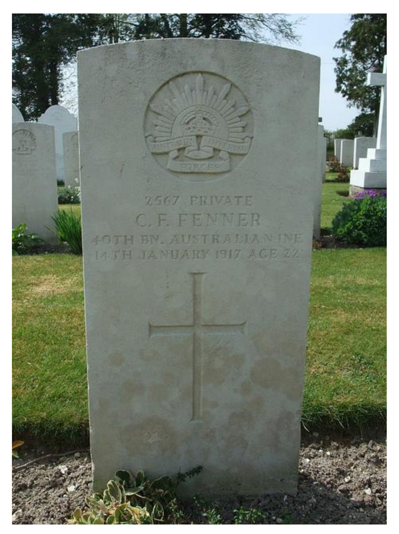
Photo of Pte C. F. Fenner's Headstone at Durrington Cemetery, Wiltshire.