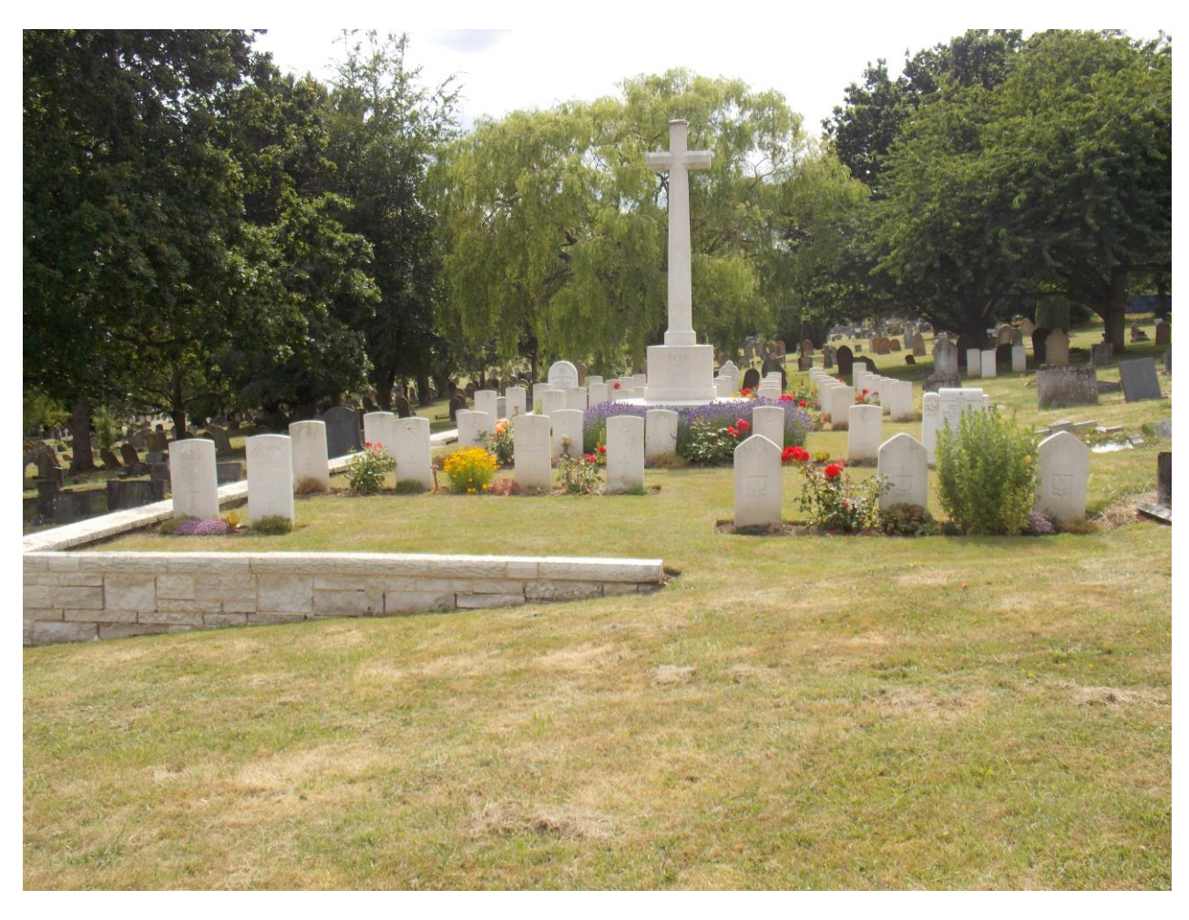
Bedford Cemetery, Bedfordshire