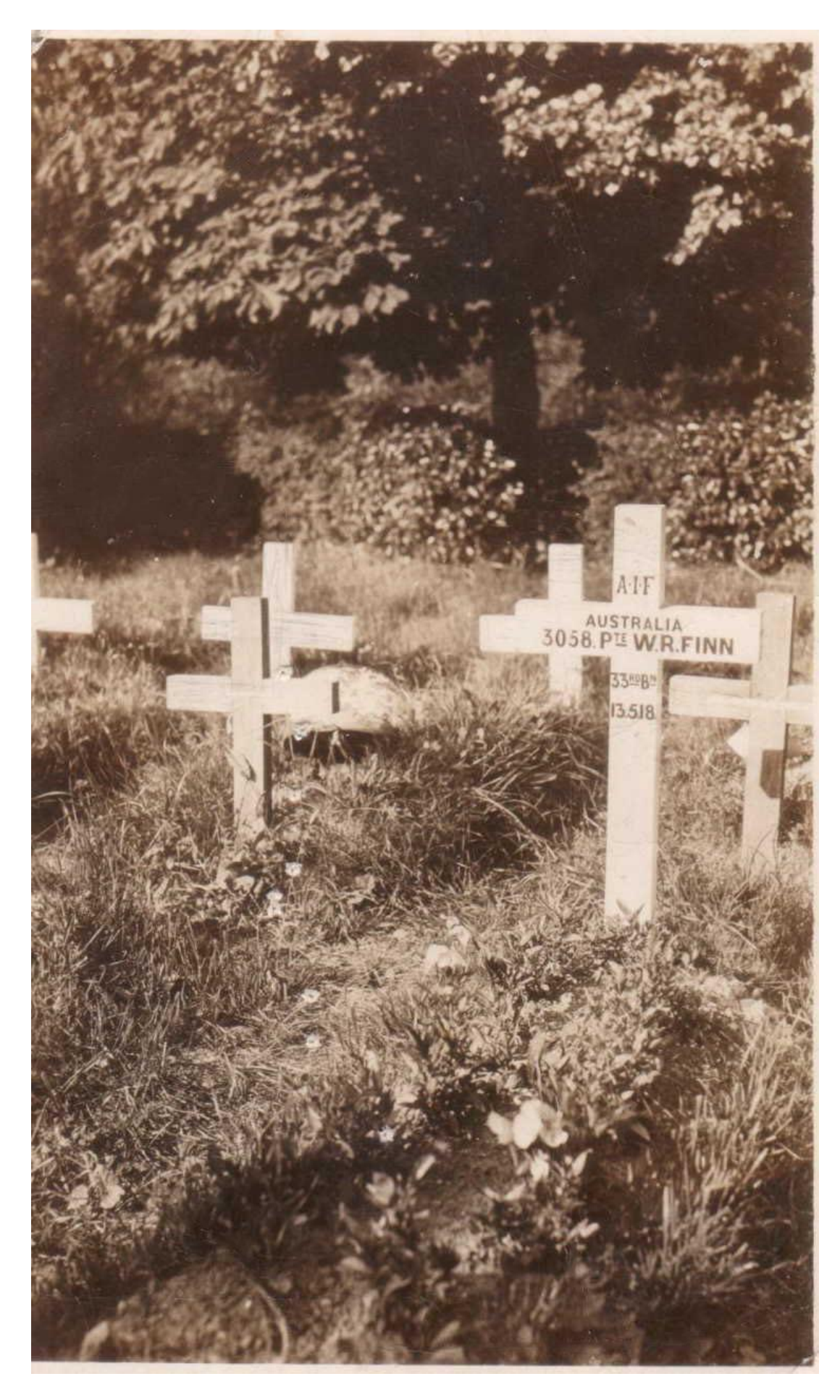
Original Grave Marker