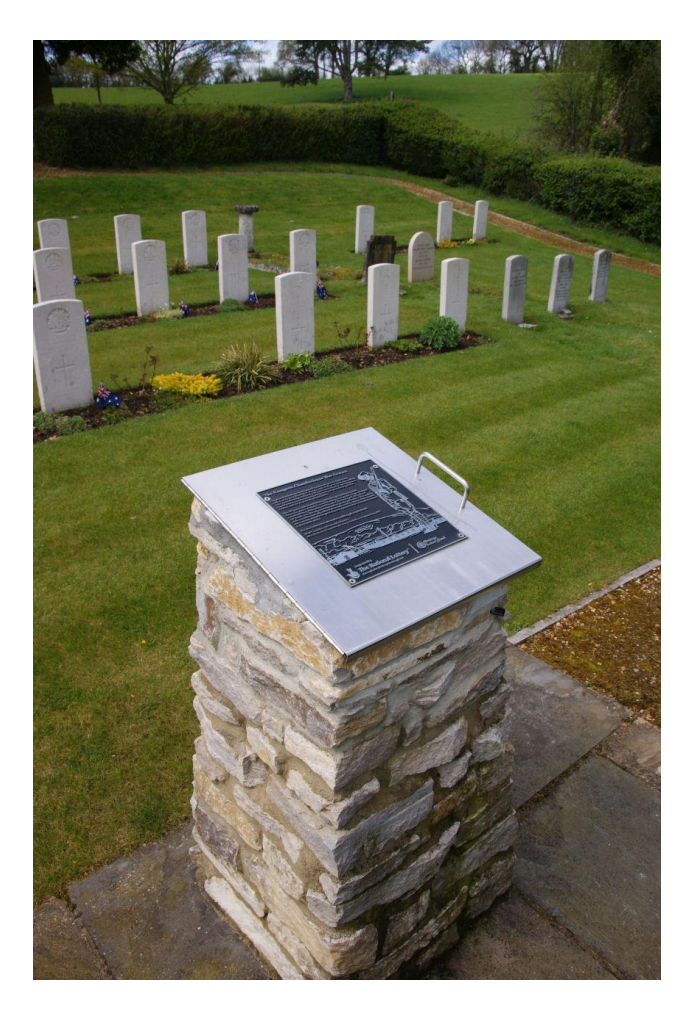
Compton Chamberlayne War Graves – showing left & right of Plinth