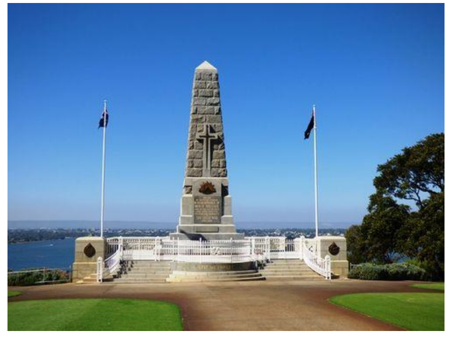
Western Australia State War Memorial Cenotaph, Kings Park

The heavy concrete foundations are supplemented by heavy brick walls which enclose an inner chamber or crypt. The walls surrounding the crypt are covered with The Roll of Honour; marble tablets which list under their units the names of more than 7,000 members of the services killed in action or as a result of World War One.