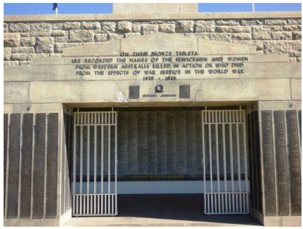
The Crypt with the Roll of Honour names