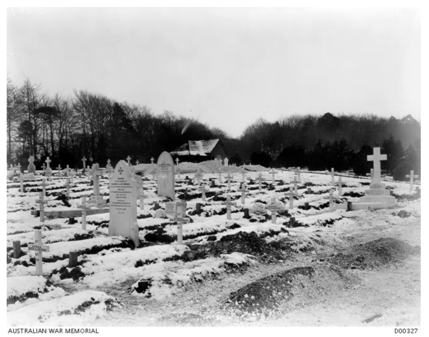
The AIF Tidworth cemetery under snow. – March 1919.

Identified graves marked by a cross and headstone in the foreground