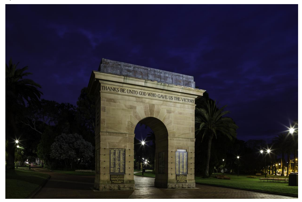
Burwood War Memorial Arch