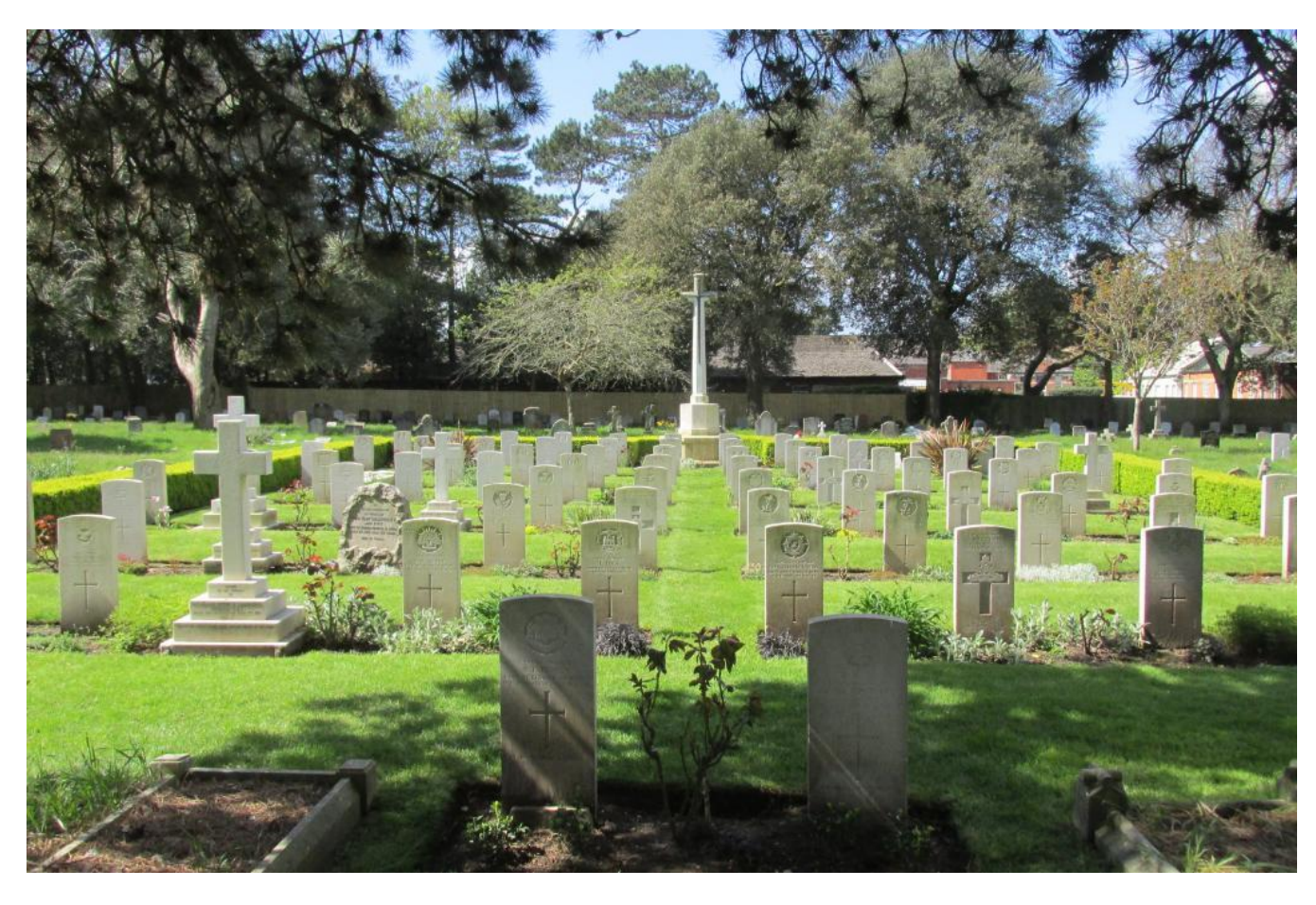
Bournemouth East Cemetery