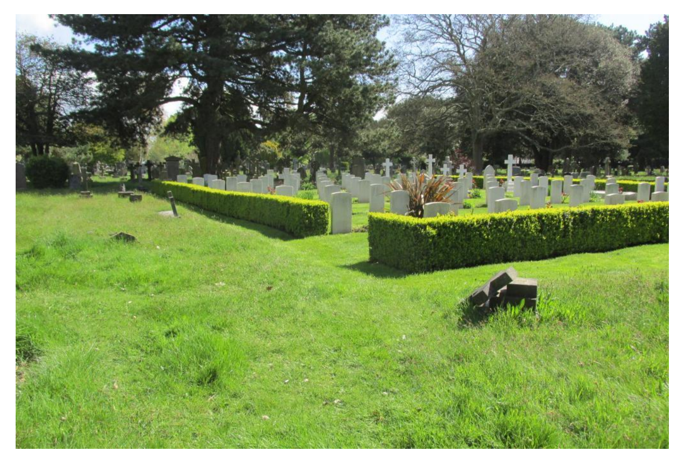
Bournemouth East Cemetery